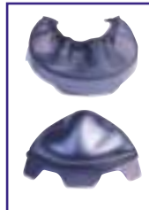
INCLUDES CHIN CURTAIN AND BREATH GUARD