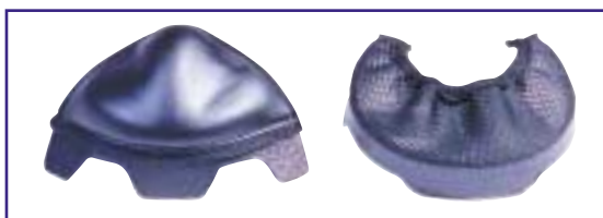
INCLUDES CHIN CURTAIN AND BREATH GUARD