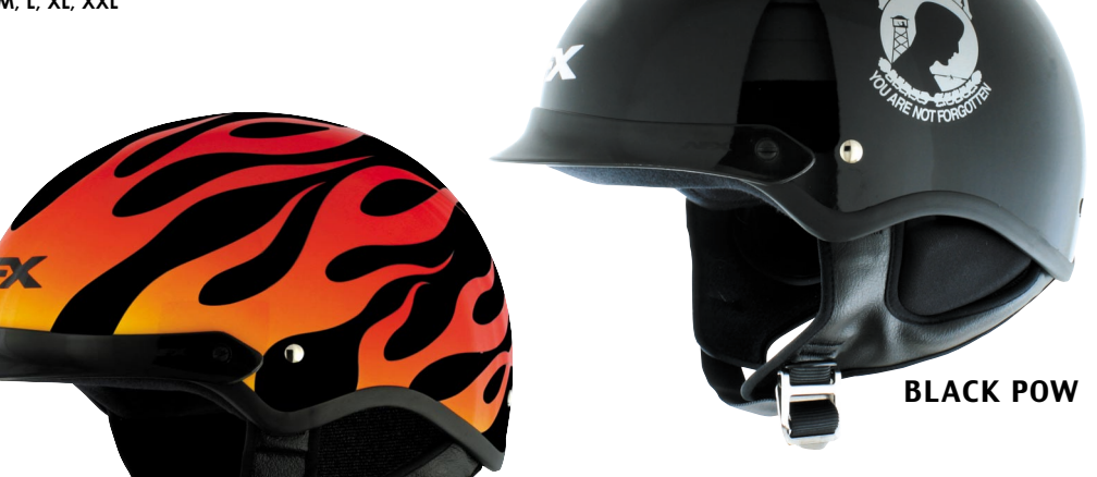
INCLUDES REPLACEABLE EAR COVER FLAPS