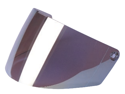
FX-0034 GOLD MIRROR