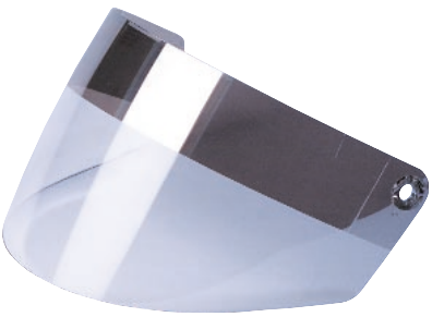
FX-0036 CLEAR/SILVER MIRROR