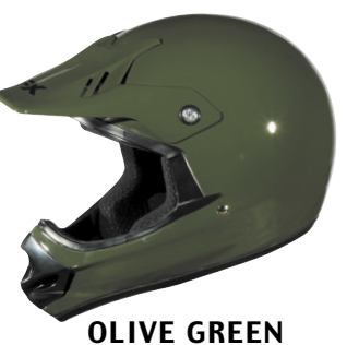
EX-8D FILL FACE OFF DOAD HELMET SNELL APPROVED MULTI/SOLID COLORS