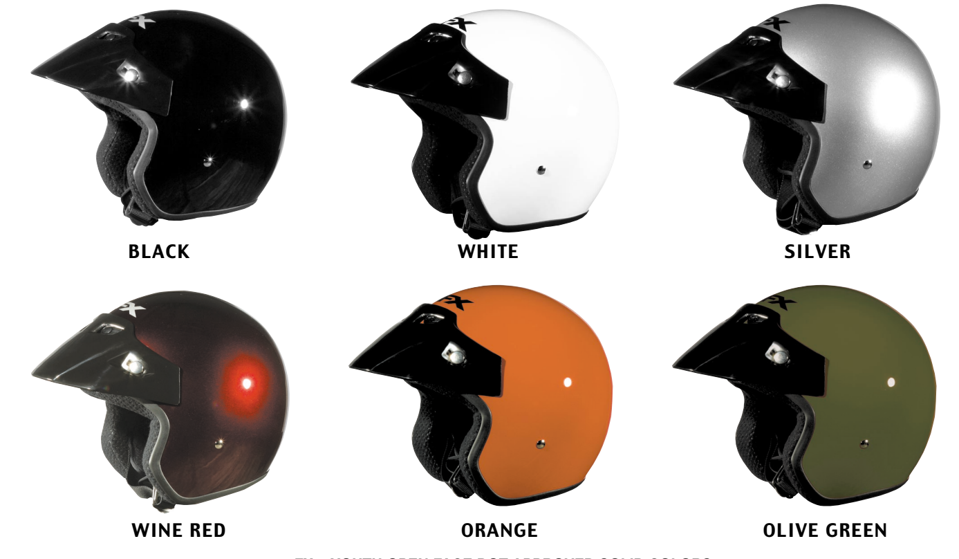
FX-5 YOUTH OPEN FACE DOT APPROVED SOLID COLORS SIZE BLACK WHITE RED LIGHT WINE ORANGE OLIVE SILVER RED GREEN Y-SMALL FX5Y-0013 FX5Y-0033 FX5Y-0053 FX5Y-0143 FX5Y-0163 FX5Y-0233 FX5Y-0243 Y-MEDIUM FX5Y-0014 FX5Y-0034 FX5Y-0054 FX5Y-0144 FX5Y-0164 FX5Y-0234 FX5Y-0244 Y-LARGE FX5Y-0015 FX5Y-0035 FX5Y-0055 FX5Y-0145 FX5Y-0165 FX5Y-0235 FX5Y-0245