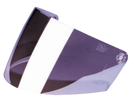
FX-0035 SILVER MIRROR

"TINTED SHIELDS ARE NOT RECOMMENDED FOR NIGHTTIME USE."