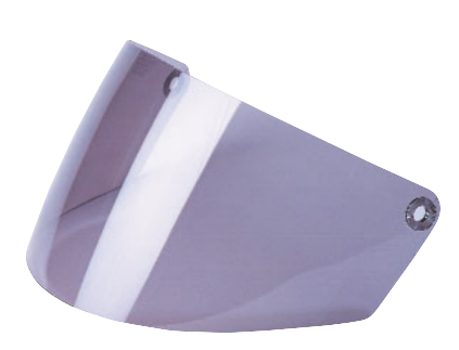
FX-0032 LIGHT SMOKE