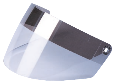
FX-0036 CLEAR/SILVER MIRROR

ALL AFX FACE SHIELDS ARE OPTICALLY CORRECT, COMPOUND CURVED, SCRATCH RESISTANT, AND UV TREATED. "TINTED SHIELDS ARE NOT RECOMMENDED FOR NIGHTTIME USE."