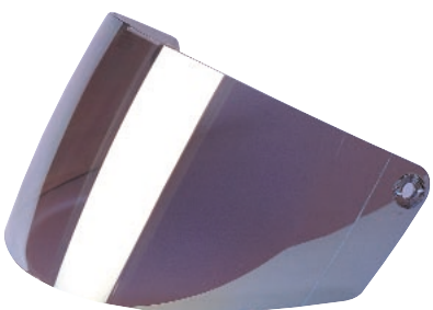
FX-0034 GOLD MIRROR