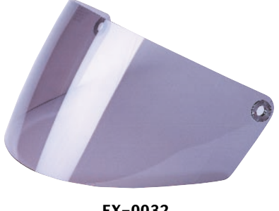
FX-0032 LIGHT SMOKE