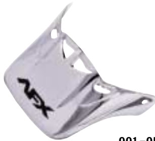
001-051 SILVER CHROME