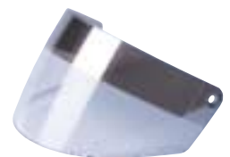
001-201 CLEAR/SILVER MIRROR

ALL AFX FACE SHIELDS ARE OPTICALLY CORRECT, COMPOUND CURVED, SCRATCH RESISTANT, AND UV TREATED.