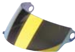
001-026 GOLD MIRROR