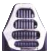
001-055 SILVER CHROME