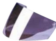
001-059 SILVER MIRROR