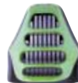
001-079 FACTORY GREEN