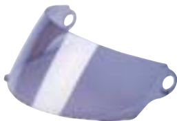
001-001 LIGHT SMOKE