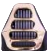
001-054 GOLD CHROME

FOR OUR FX-6R, FX-8R, AND FX-9 HELMETS ALL YEARS