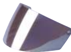
001-058 GOLD MIRROR