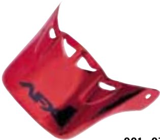
001-074 RED CHROME