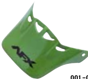
001-075 FACTORY GREEN