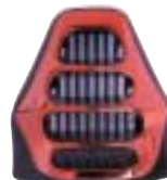
001-078 RED CHROME