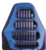
001-077 BLUE CHROME