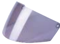
001-014 LIGHT SMOKE