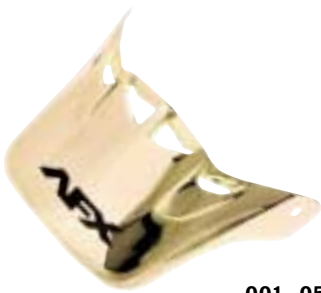
001-050 GOLD CHROME

FOR OUR FX-6R, FX-8R, AND FX-9 HELMETS ALL YEARS