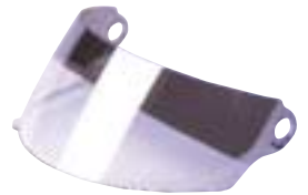
001-200 CLEAR/SILVER MIRROR

AFX REVOLUTIONARY NEW DESIGN GP TWO TONE SHIELD - CLEAR LOWER SECTION WITH MIRROR FINISHED UPPER SECTION.