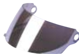
001-027 SILVER MIRROR