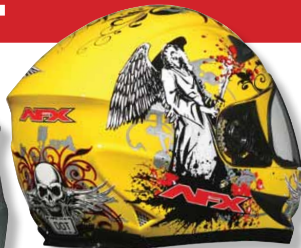
YELLOW DARK ANGEL