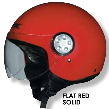
FLAT RED SOLID