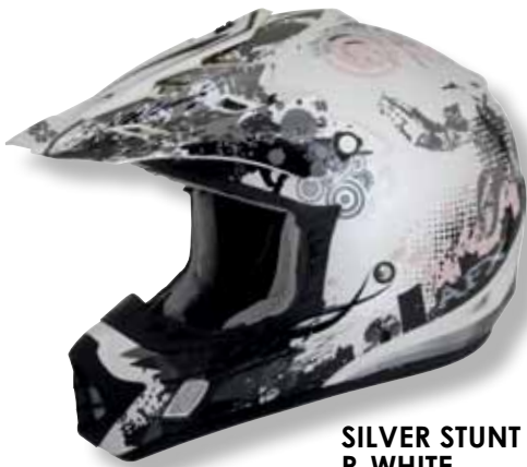
SILVER STUNT P-WHITE