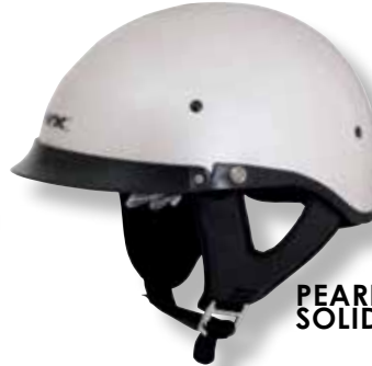
PEARL WHITE SOLID