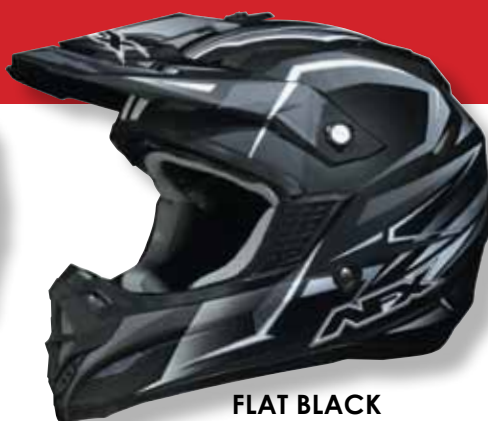
FLAT BLACK MULTI