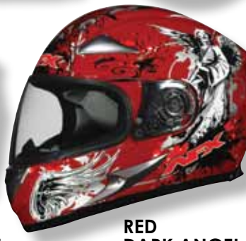
RED DARK ANGEL