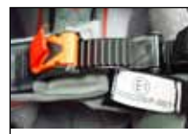
AFX DOT/ECE Cam buckle quick release