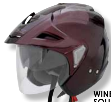
WINE RED SOLID