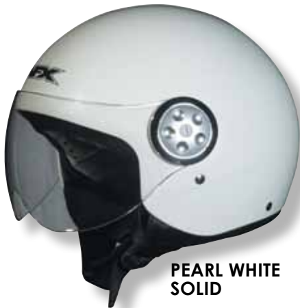
PEARL WHITE SOLID