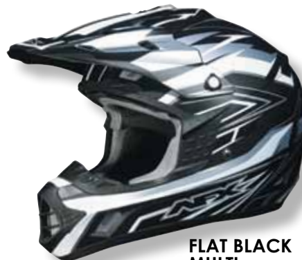
FLAT BLACK MULTI