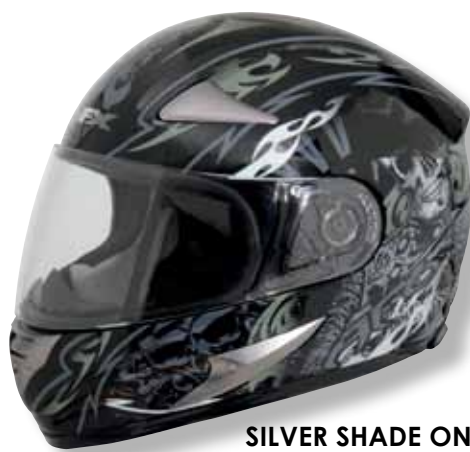
SILVER SHADE ON GLOSS BLACK