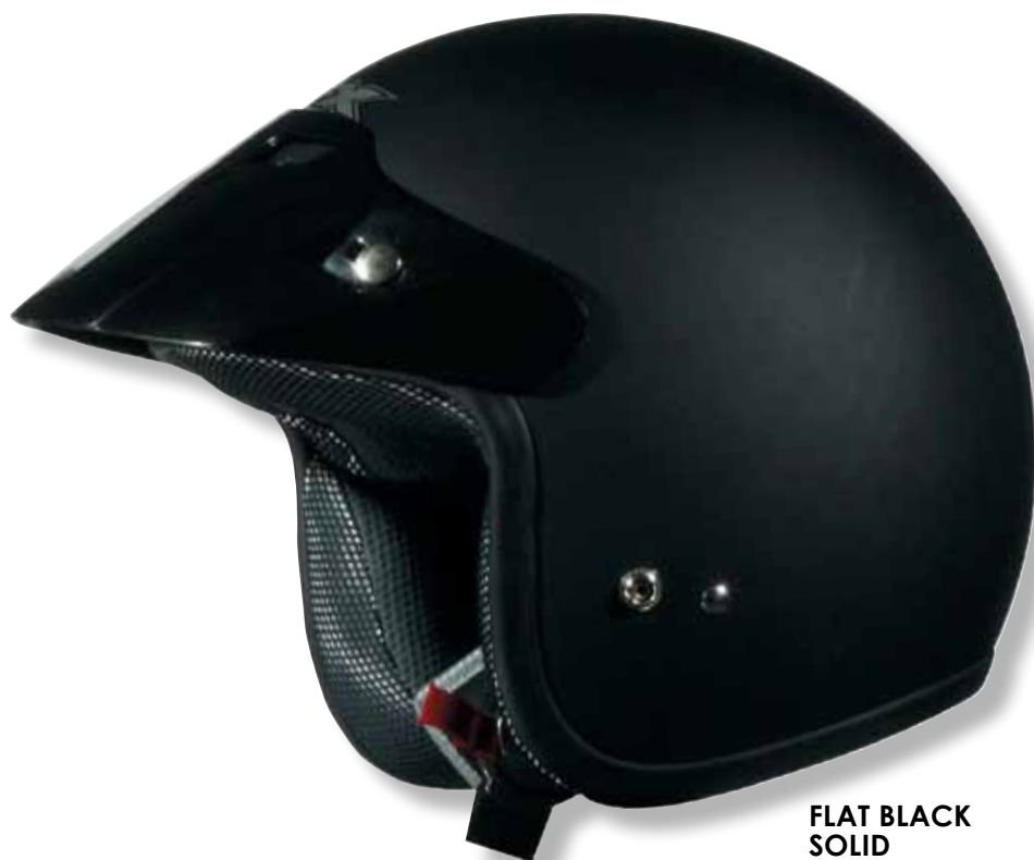
FLAT BLACK SOLID