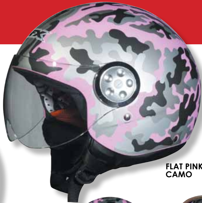
FLAT PINK CAMO