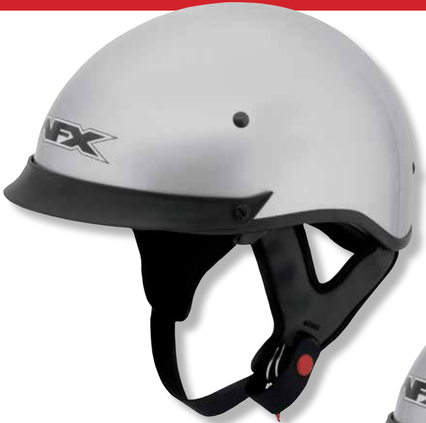
LIGHT SILVER SOLID