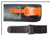
AFX DOT/ECE Cam buckle quick release