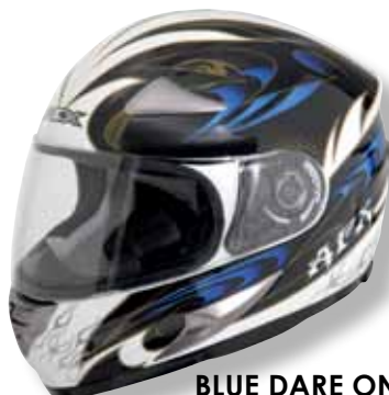
BLUE DARE ON PEARL WHITE