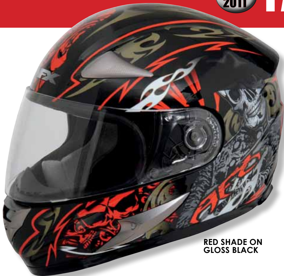
RED SHADE ON GLOSS BLACK