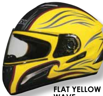
FLAT YELLOW WAVE