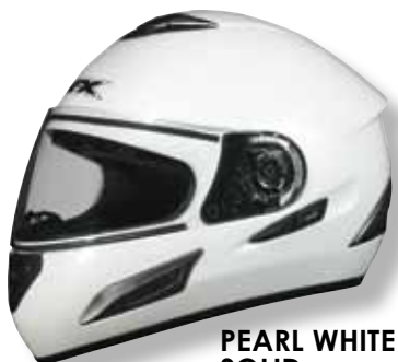
PEARL WHITE SOLID