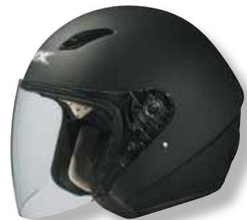
FLAT BLACK SOLID