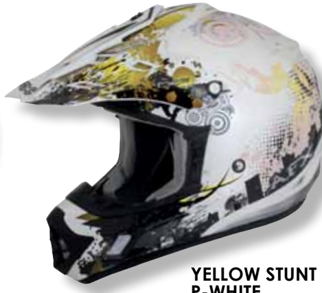
YELLOW STUNT P-WHITE