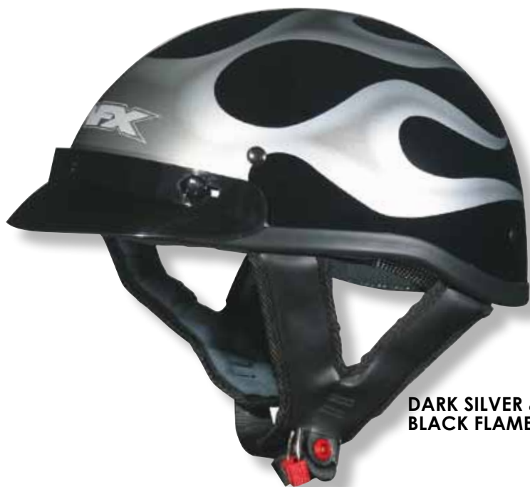
DARK SILVER & BLACK FLAME