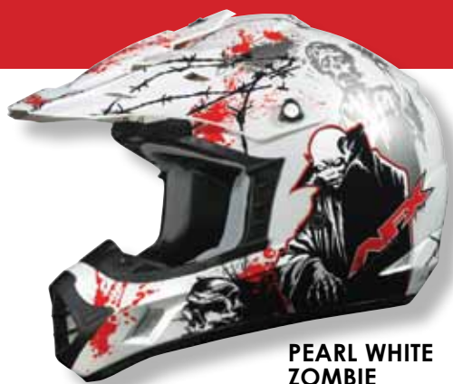
PEARL WHITE ZOMBIE