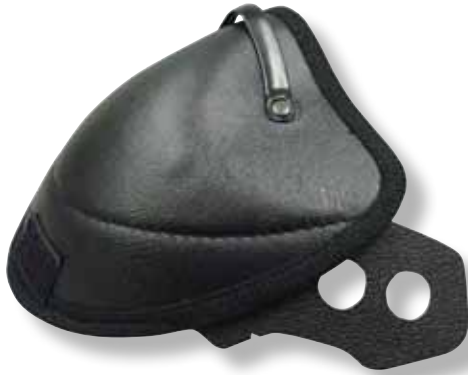
FX-17, 17BH, 17Y SNOW BREATH GUARD PART NUMBER :0134-1214