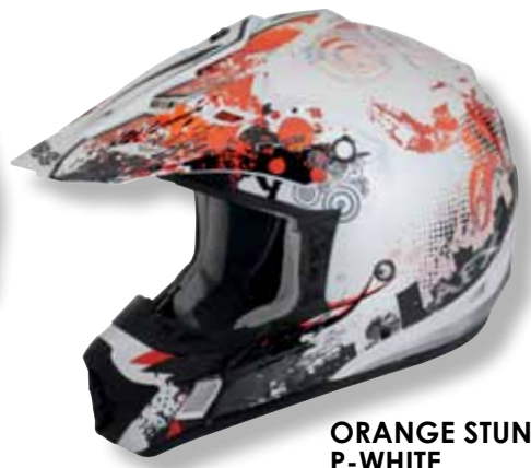
ORANGE STUNT P-WHITE