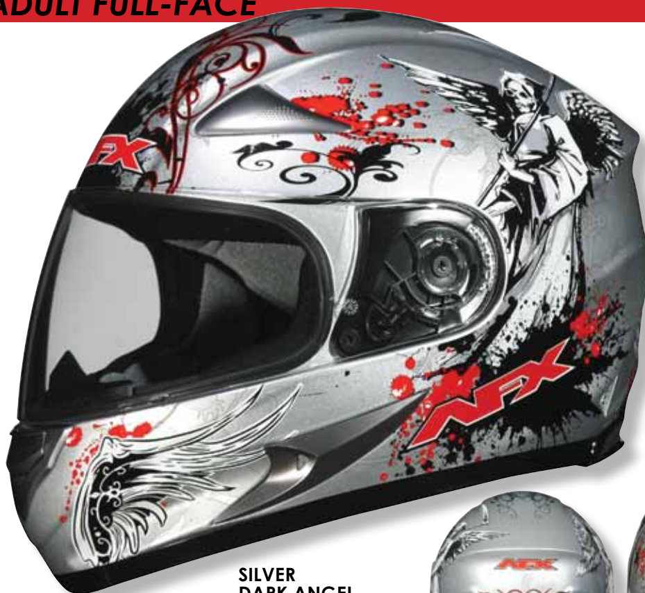
SILVER DARK ANGEL