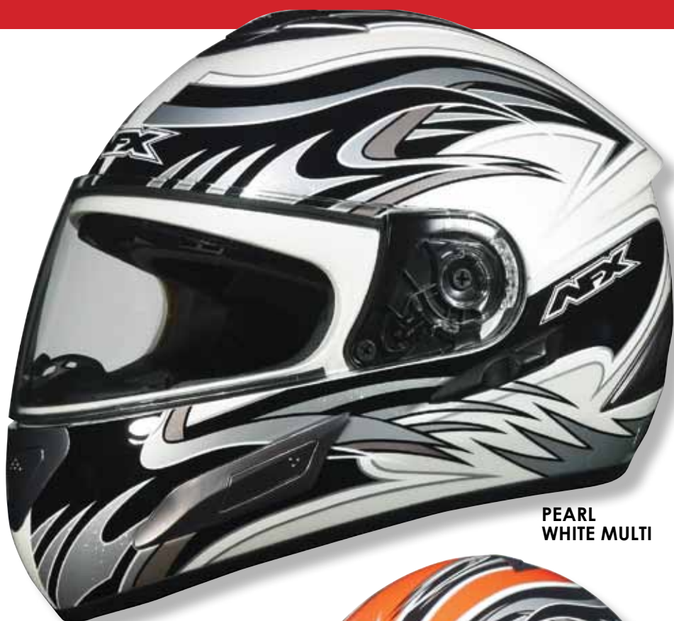
PEARL WHITE MULTI