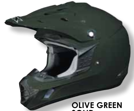
OLIVE GREEN SOLID