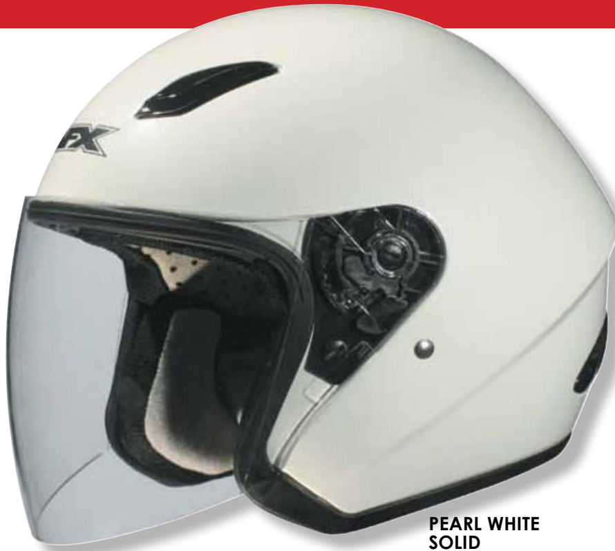
PEARL WHITE SOLID