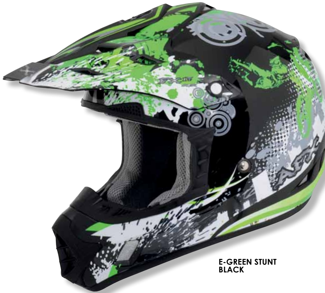
E-GREEN STUNT BLACK