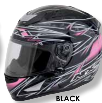
BLACK PINK MULTI