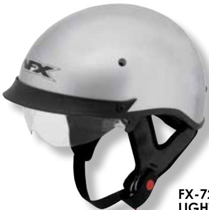
FX-72 LIGHT SILVER SOLID