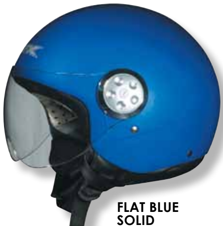
FLAT BLUE SOLID