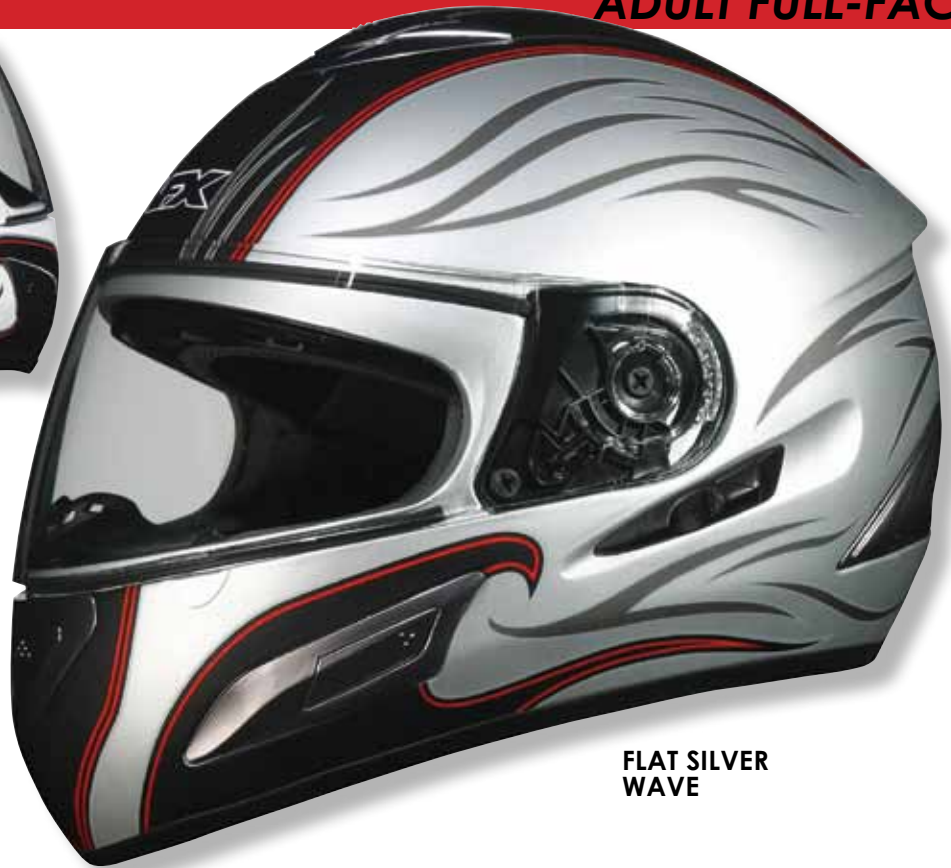
FLAT SILVER WAVE