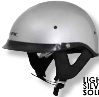
LIGHT SILVER SOLID