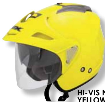
HI-VIS NEON YELLOW