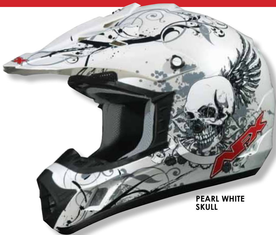
PEARL WHITE SKULL