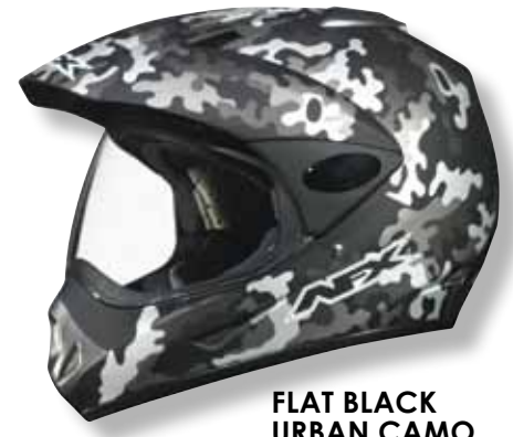
FLAT BLACK URBAN CAMO