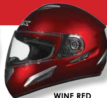
WINE RED SOLID