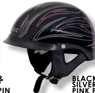
BLACK & SILVER / PINK PIN FLAME