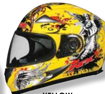
YELLOW DARK ANGEL