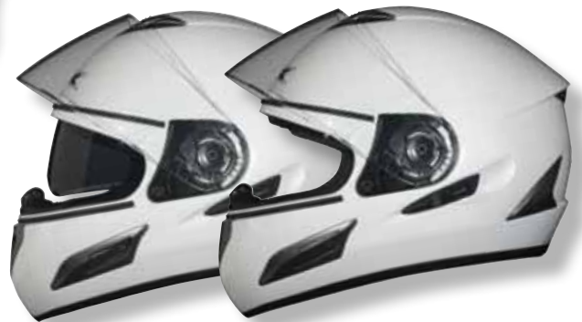
FX-100 Dark smoke tinted one touch inner flip down sun shield system