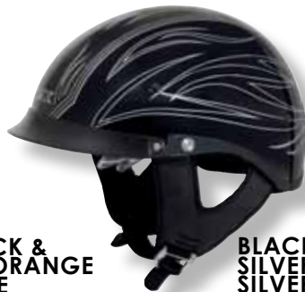
BLACK & SILVER / SILVER PIN FLAME