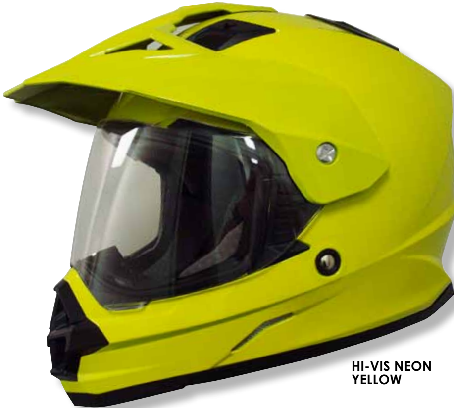
HI-VIS NEON YELLOW

INCLUDES FLAT BLACK SIDE-COVERS AND SCREW PLUG FOR SHIELD USE WITHOUT THE VISOR