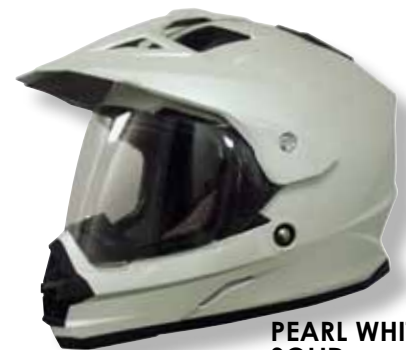
PEARL WHITE SOLID