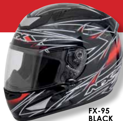
FX-95 BLACK RED MULTI