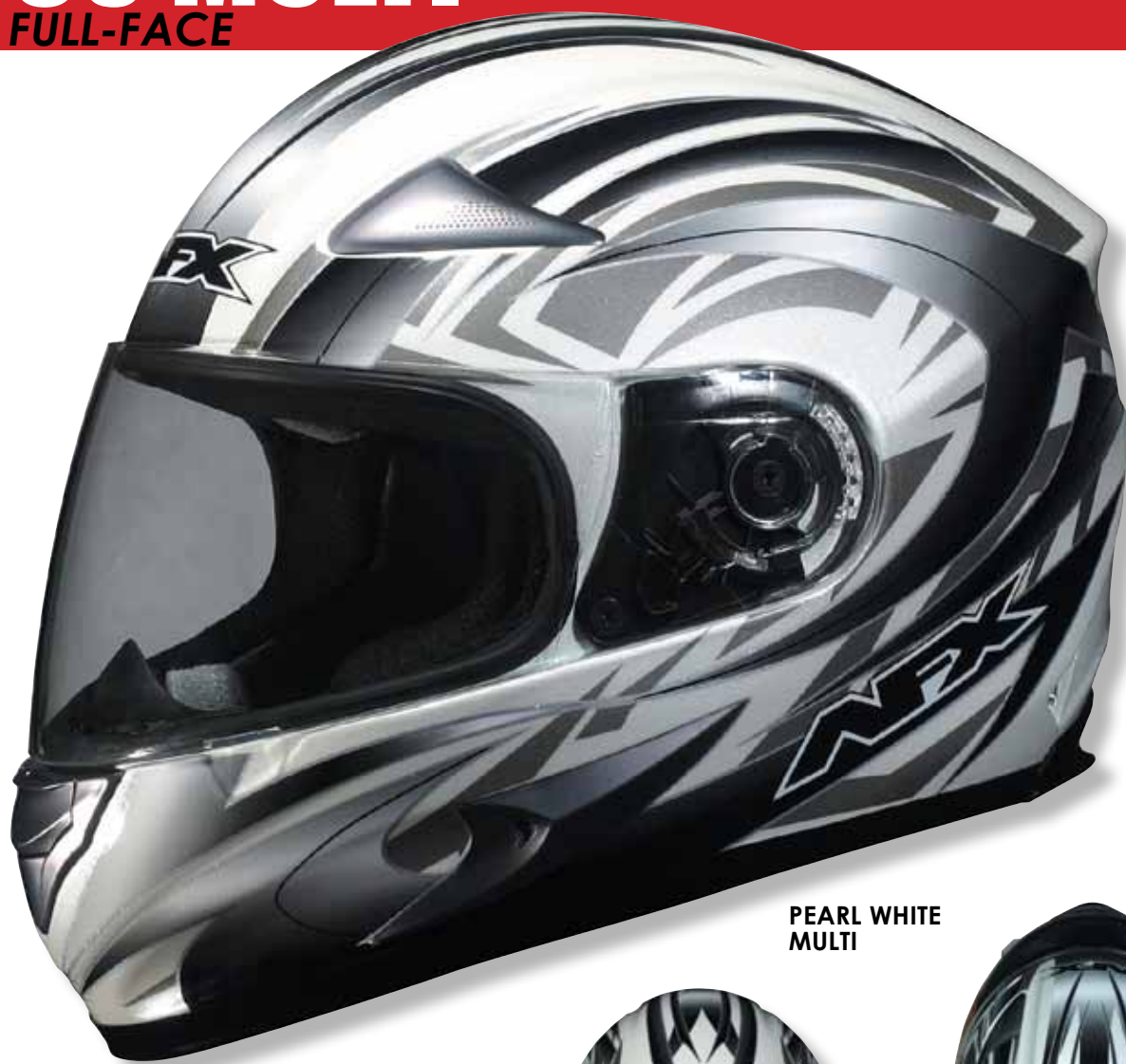
PEARL WHITE MULTI