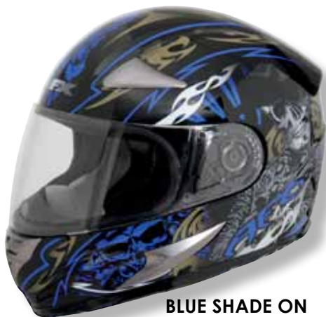
BLUE SHADE ON GLOSS BLACK