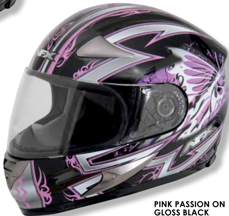
PINK PASSION ON GLOSS BLACK