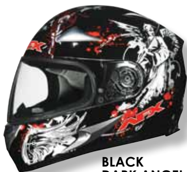
BLACK DARK ANGEL