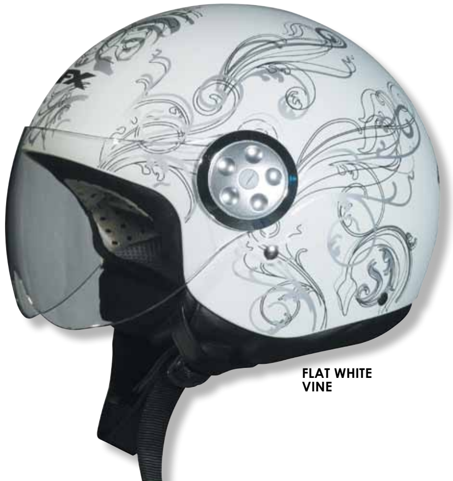
FLAT WHITE VINE