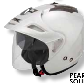
PEARL WHITE SOLID