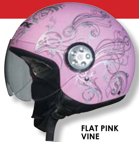
FLAT PINK VINE