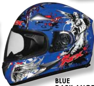
BLUE DARK ANGEL