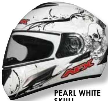
PEARL WHITE SKULL