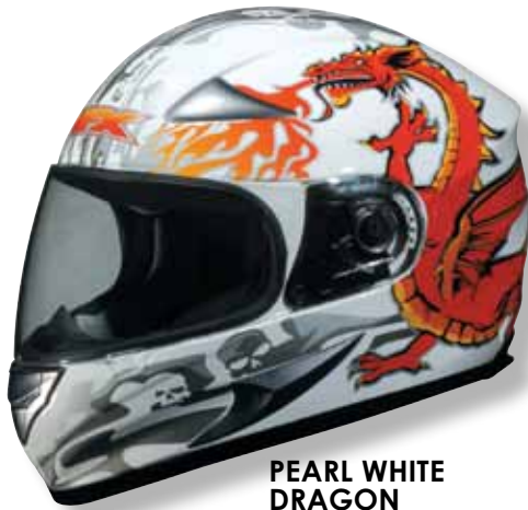
PEARL WHITE DRAGON