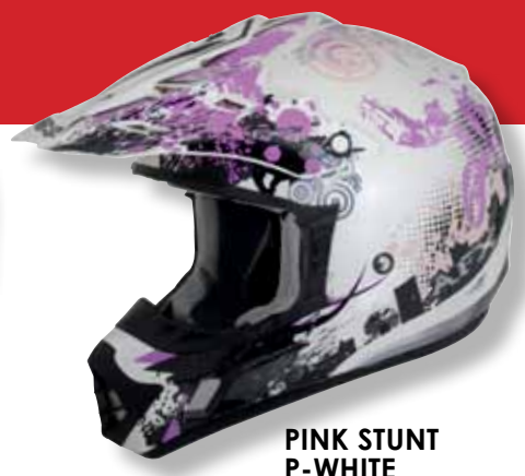
PINK STUNT P-WHITE