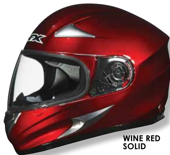
WINE RED SOLID