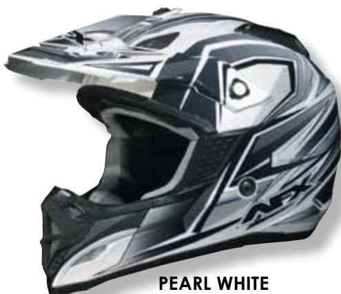
PEARL WHITE MULTI