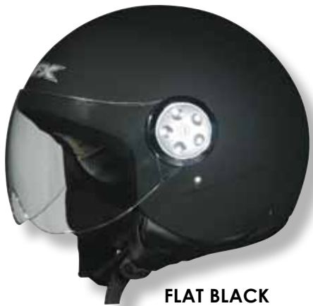
FLAT BLACK SOLID