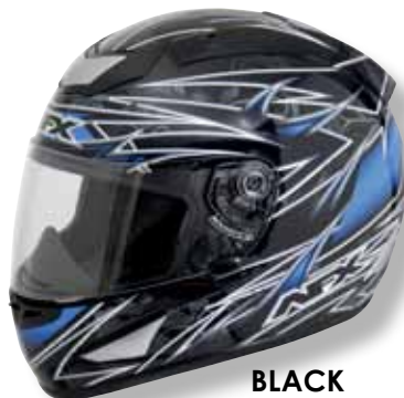
BLACK BLUE MULTI