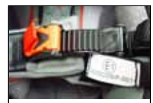
AFX DOT/ECE Cam buckle quick release