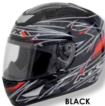
BLACK RED MULTI