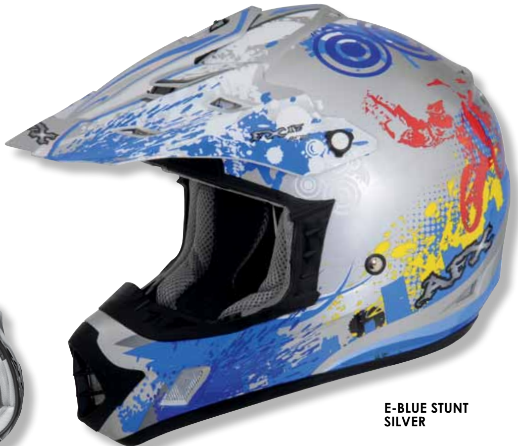
E-BLUE STUNT SILVER