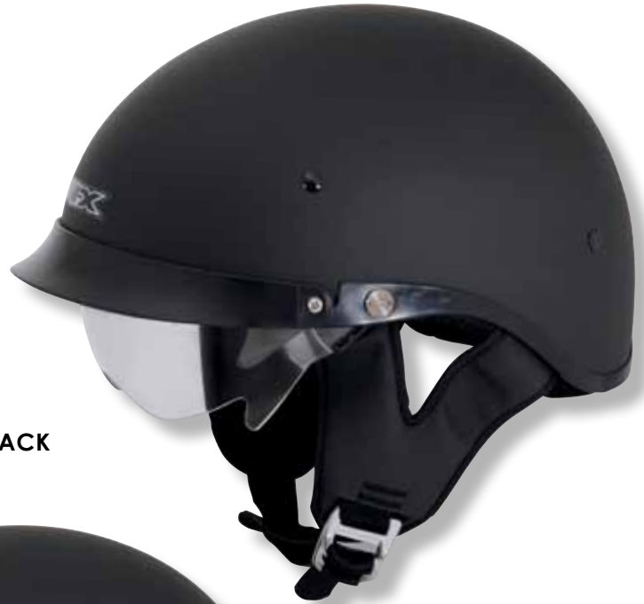
FLAT BLACK SOLID