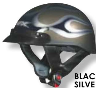
BLACK & SILVER FLAME