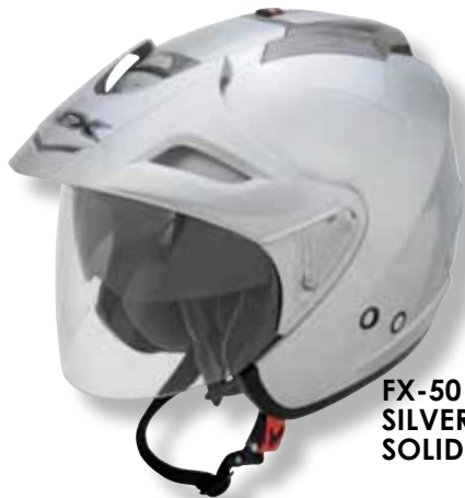
FX-50 SILVER SOLID