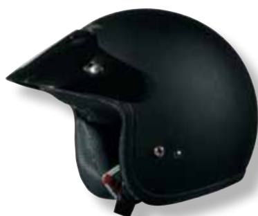
FLAT BLACK SOLID