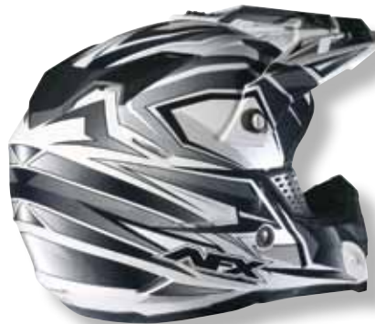
PEARL WHITE MULTI