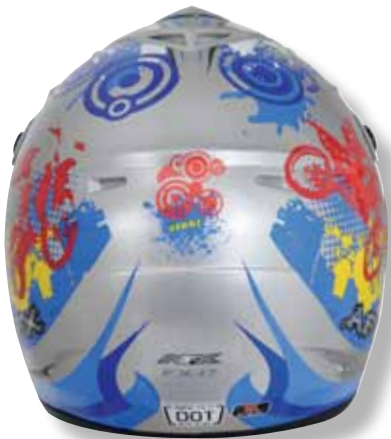
SILVER STUNT P-WHITE