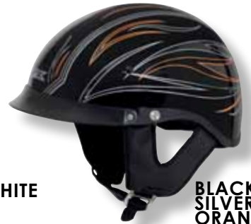
BLACK & SILVER / ORANGE PIN FLAME