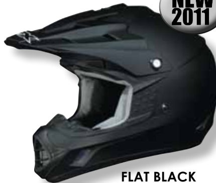
FLAT BLACK SOLID