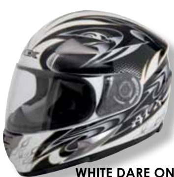
WHITE DARE ON PEARL WHITE