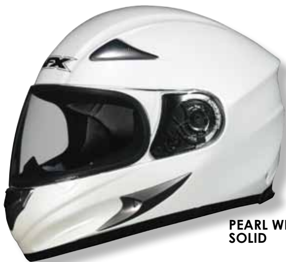
PEARL WHITE SOLID