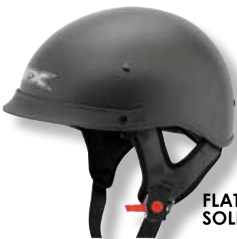
FLAT BLACK SOLID