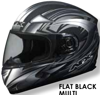
FLAT BLACK MULTI