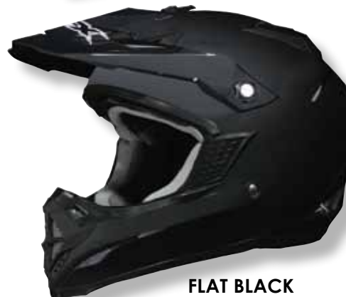
FLAT BLACK SOLID