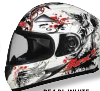
PEARL WHITE DARK ANGEL