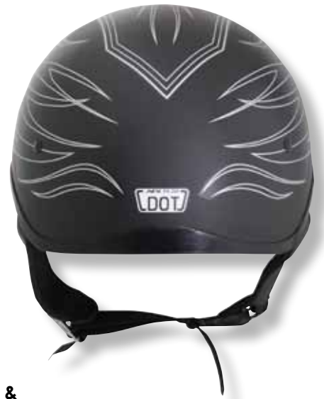
FLAT BLACK & SILVER / SILVER PIN FLAME