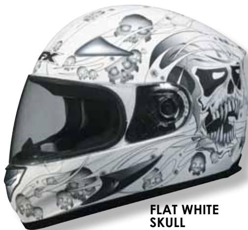
FLAT WHITE SKULL