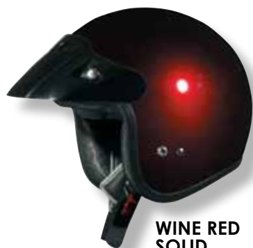
WINE RED SOLID