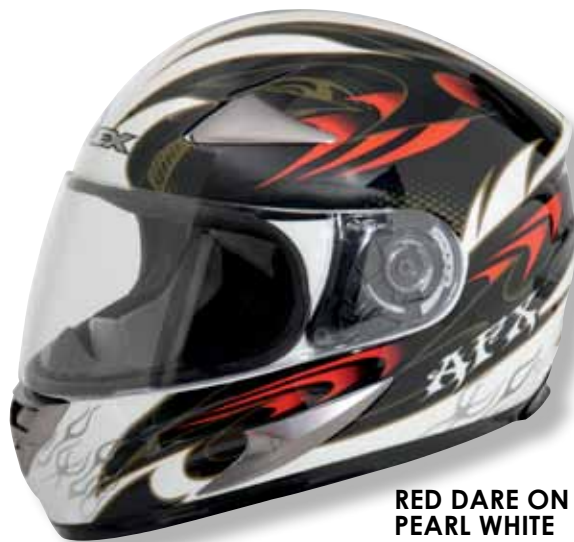
RED DARE ON PEARL WHITE