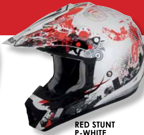
RED STUNT P-WHITE