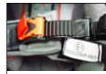
AFX DOT/ECE Cam buckle quick release

XS 0110-2508 S 0110-2509 M 0110-2510 L 0110-2511 XL 0110-2512 XXL 0110-2513