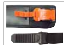
AFX DOT/ECE Cam buckle quick release