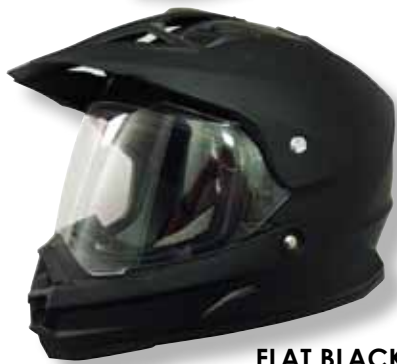
FLAT BLACK SOLID