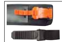
AFX DOT/ECE Cam buckle quick release