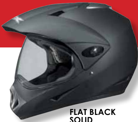
FLAT BLACK SOLID