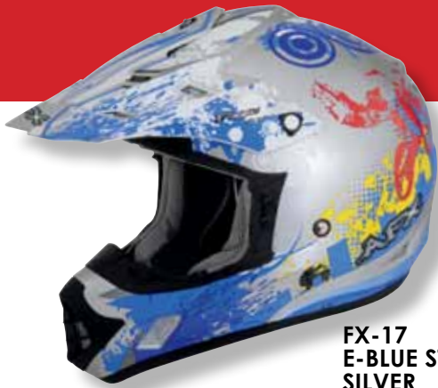
FX-17 E-BLUE STUNT SILVER