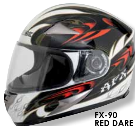
FX-90 RED DARE ON PEARL WHITE