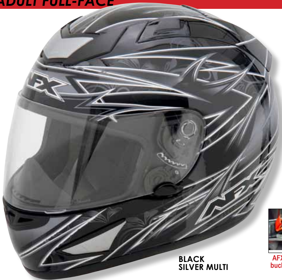
BLACK SILVER MULTI