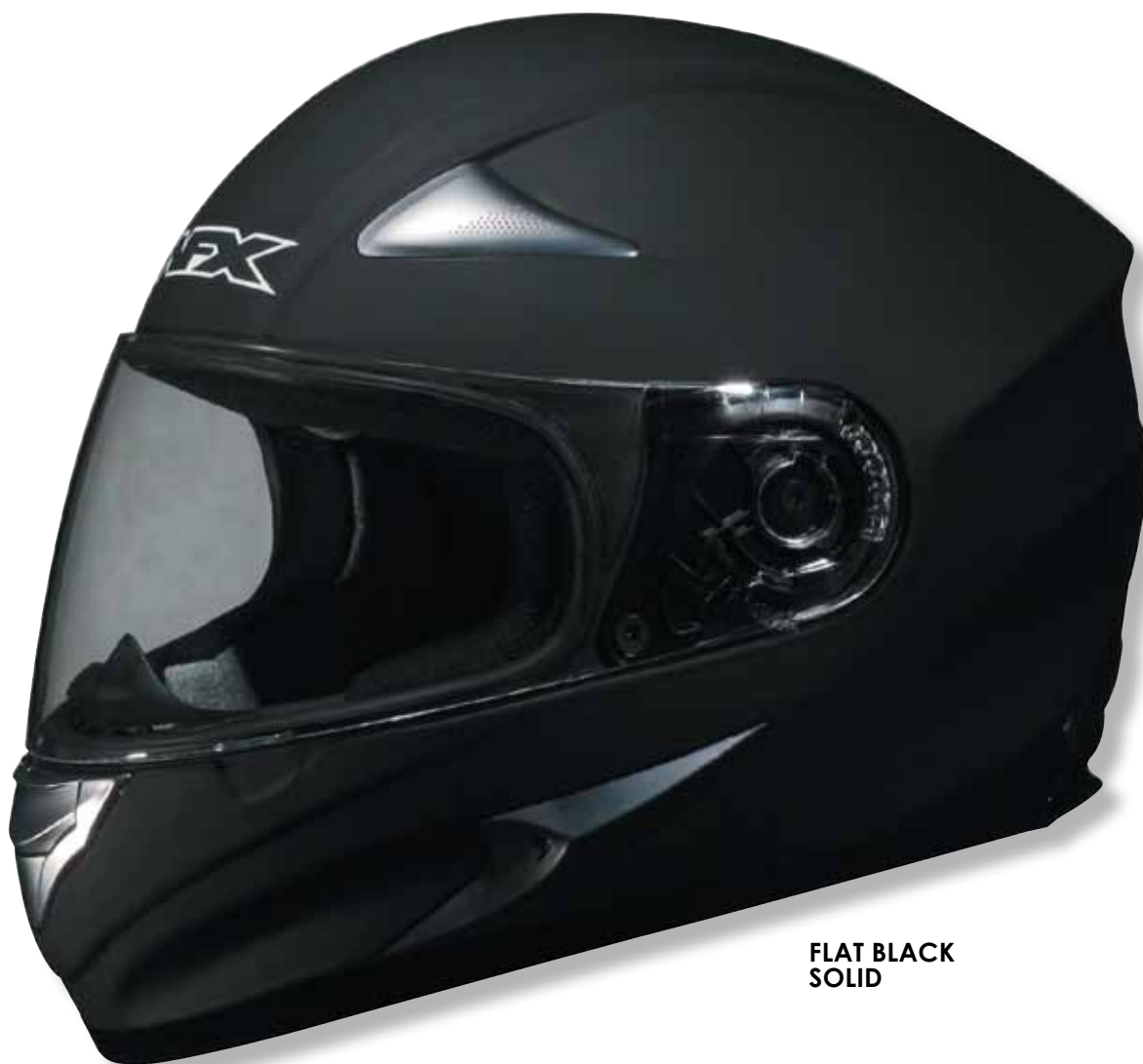
FLAT BLACK SOLID