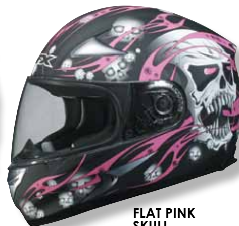
FLAT PINK SKULL