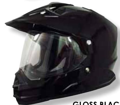
GLOSS BLACK SOLID