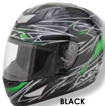
BLACK GREEN MULTI