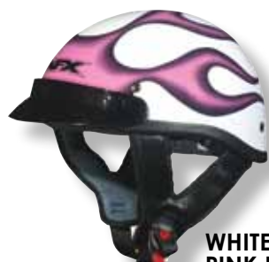
WHITE & PINK FLAME