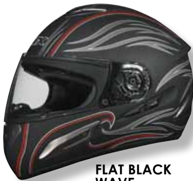
FLAT BLACK WAVE