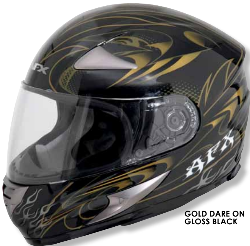
GOLD DARE ON GLOSS BLACK