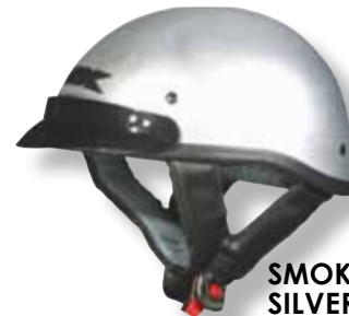
SMOKE SILVER CHROME