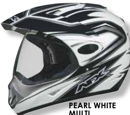
PEARL WHITE MULTI