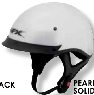
PEARL WHITE SOLID