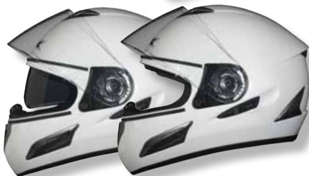
FX-100 Dark smoke tinted one touch inner flip down sun shield system