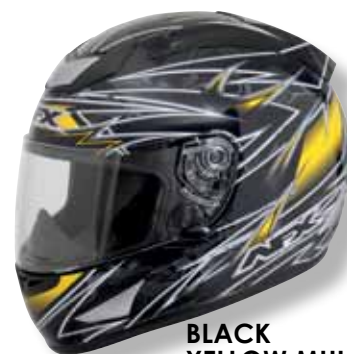
BLACK YELLOW MULTI