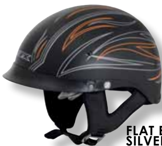
FLAT BLACK & SILVER / ORANGE PIN FLAME