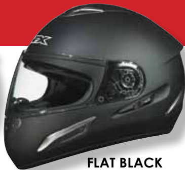
FLAT BLACK SOLID