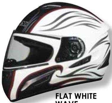
FLAT WHITE WAVE