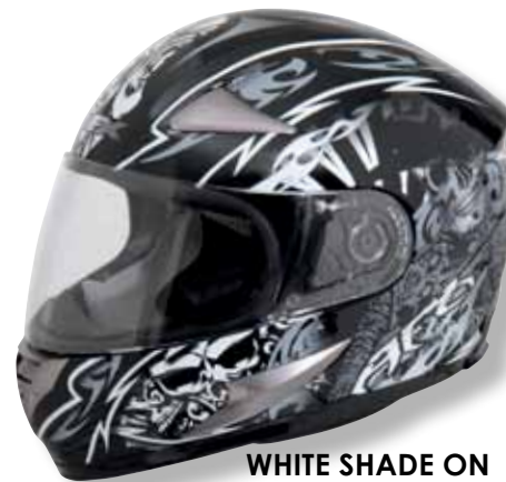
WHITE SHADE ON GLOSS BLACK