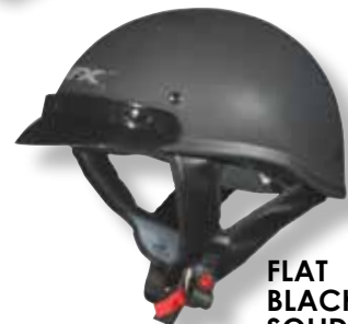
FLAT BLACK SOLID