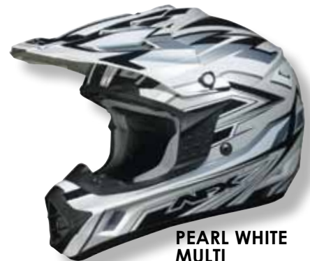
PEARL WHITE MULTI