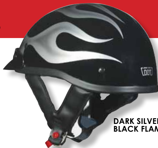
DARK SILVER & BLACK FLAME