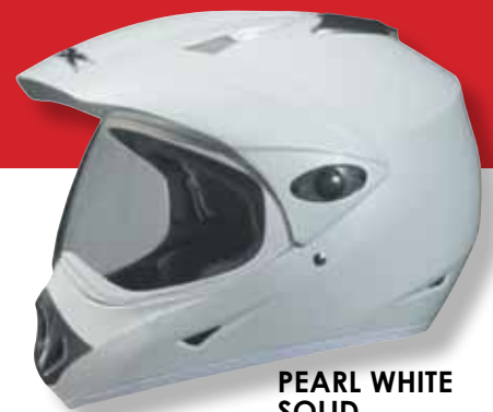
PEARL WHITE SOLID