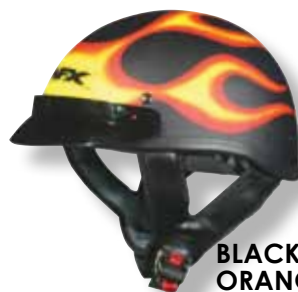
BLACK / ORANGE FLAME