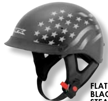
FLAT BLACK STEALTH