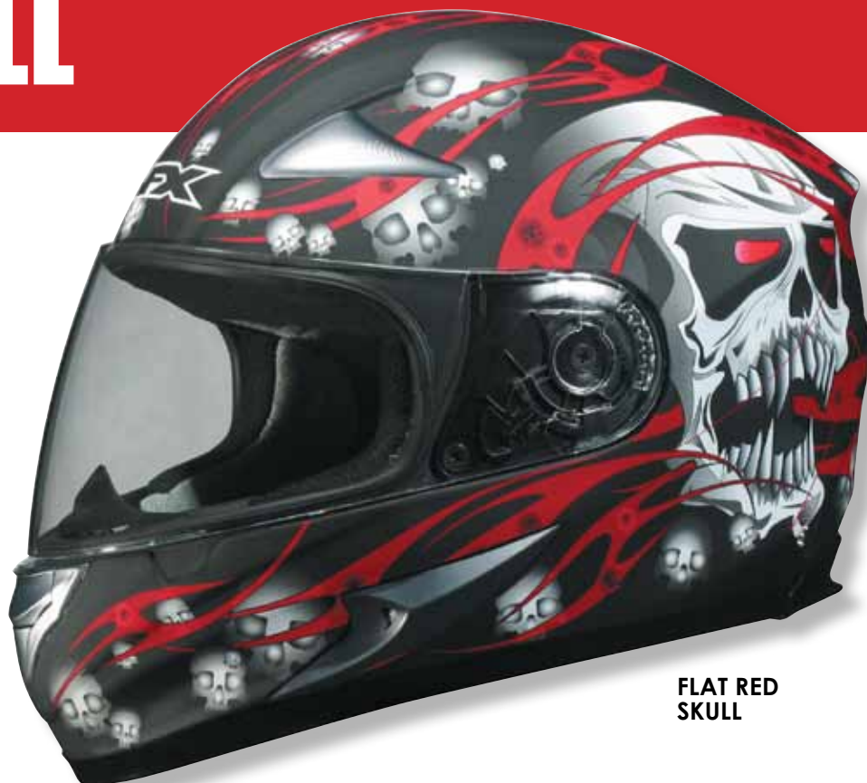
FLAT RED SKULL