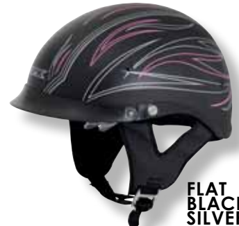
FLAT BLACK & SILVER / PINK PIN FLAME