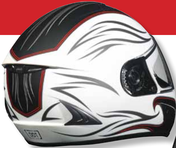
FLAT WHITE WAVE