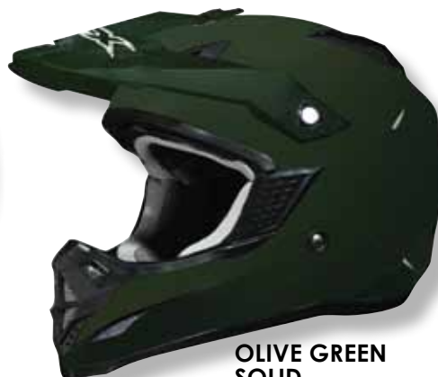
OLIVE GREEN SOLID