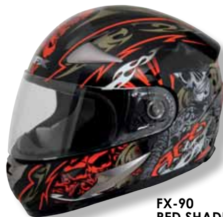
FX-90 RED SHADE ON GLOSS BLACK