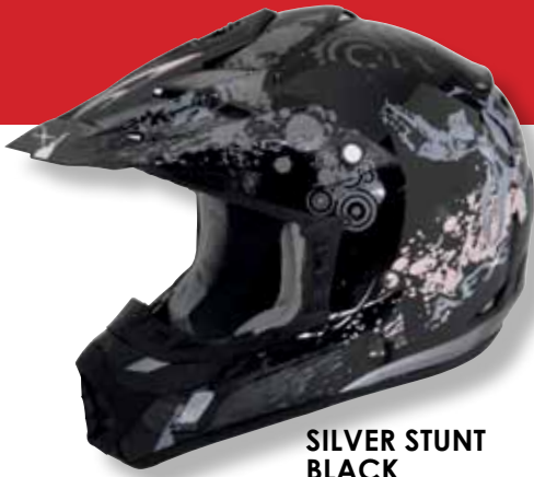
SILVER STUNT BLACK