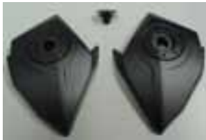
INCLUDES FLAT BLACK SIDE-COVERS AND SCREW PLUG FOR SHIELD USE WITHOUT THE VISOR