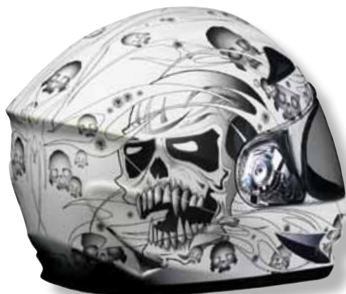
FLAT WHITE SKULL