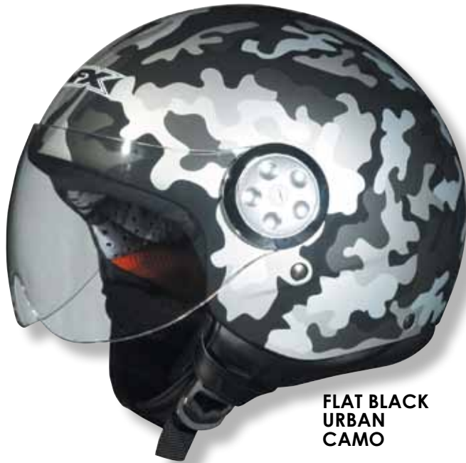
FLAT BLACK URBAN CAMO