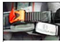
AFX DOT/ECE Cam buckle quick release