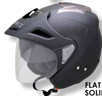
FLAT BLACK SOLID