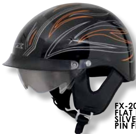
FX-200 FLAT BLACK & SILVER / ORANGE PIN FLAME