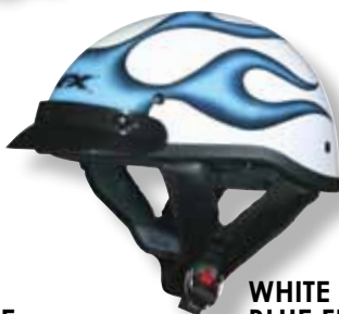
WHITE & BLUE FLAME