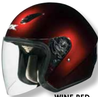
WINE RED SOLID