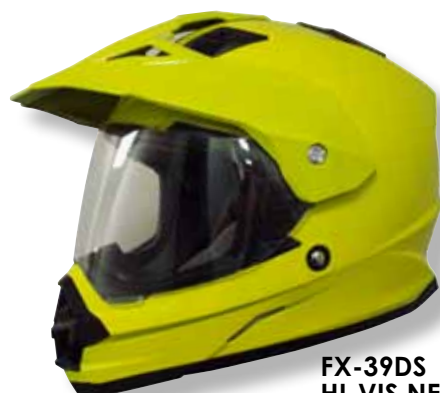
FX-39DS HI-VIS NEON YELLOW