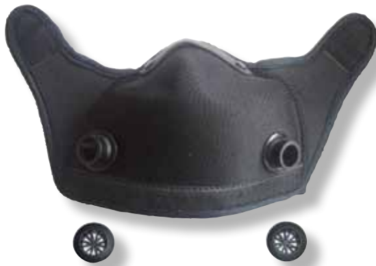
FX-17, 17BH, SNOW BREATH GUARD PART NUMBER :0134-1060