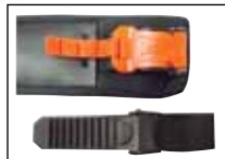
AFX DOT/ECE Cam buckle quick release