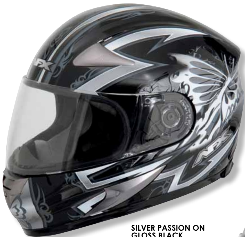
SILVER PASSION ON GLOSS BLACK