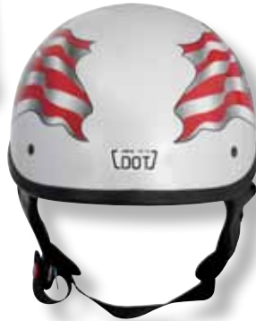
PEARL WHITE FREEDOM