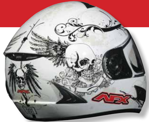
PEARL WHITE SKULL