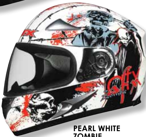
PEARL WHITE ZOMBIE