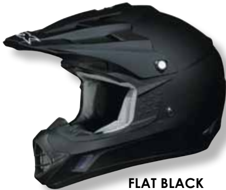
FLAT BLACK SOLID