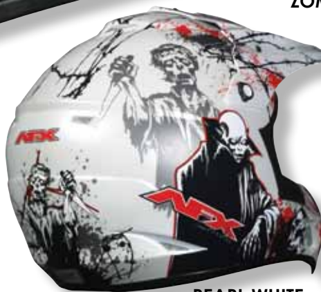
PEARL WHITE ZOMBIE