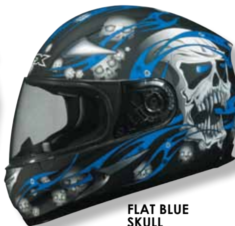
FLAT BLUE SKULL