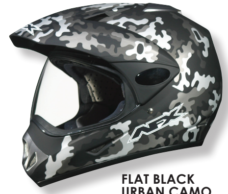
FLAT BLACK URBAN CAMO