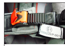
AFX DOT/ECE Cam buckle quick release

XS 0110-2508 S 0110-2509 M 0110-2510 L 0110-2511 XL 0110-2512 XXL 0110-2513