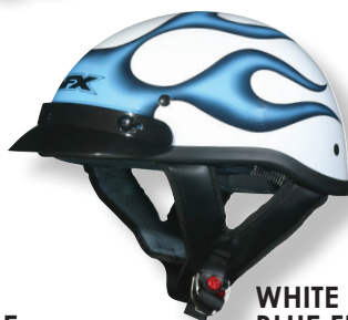
WHITE & BLUE FLAME