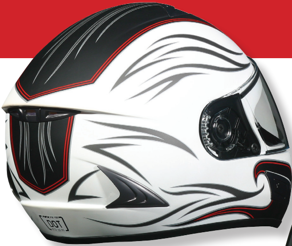
FLAT WHITE WAVE