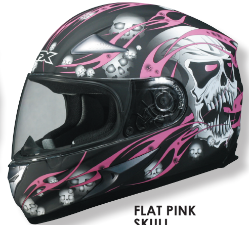
FLAT PINK SKULL