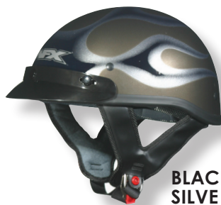
BLACK & SILVER FLAME