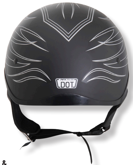
FLAT BLACK & SILVER / SILVER PIN FLAME