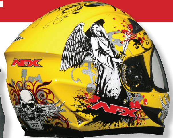
YELLOW DARK ANGEL