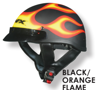
BLACK / ORANGE FLAME