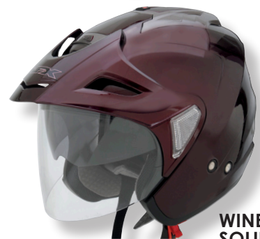
WINE RED SOLID