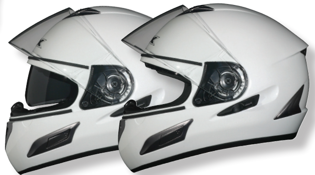
FX-100 Dark smoke tinted one touch inner flip down sun shield system