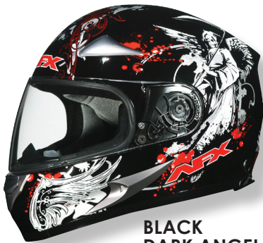
BLACK DARK ANGEL