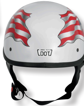
PEARL WHITE FREEDOM