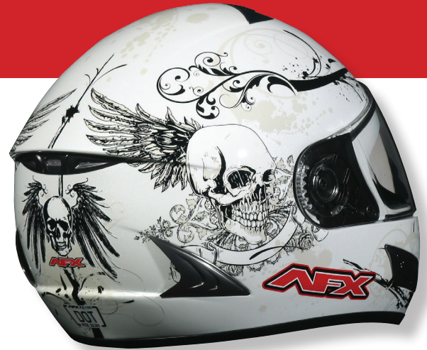
PEARL WHITE SKULL