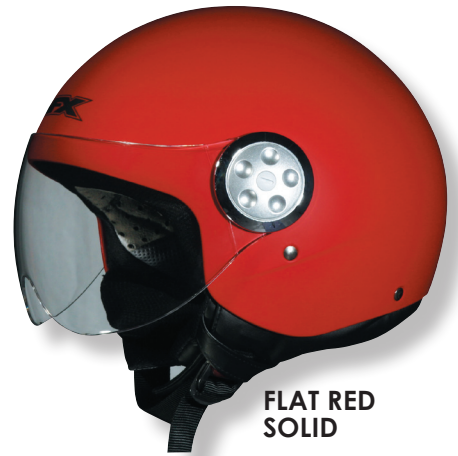
FLAT RED SOLID