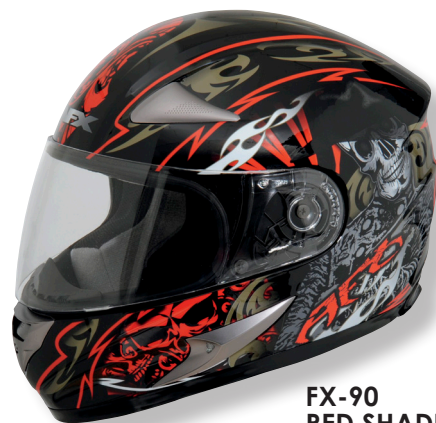
FX-90 RED SHADE ON GLOSS BLACK