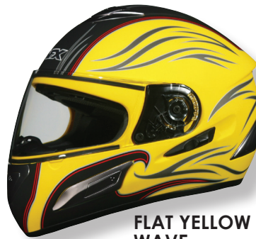
FLAT YELLOW WAVE