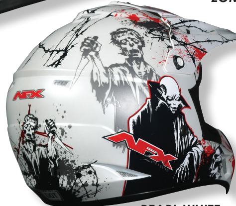
PEARL WHITE ZOMBIE