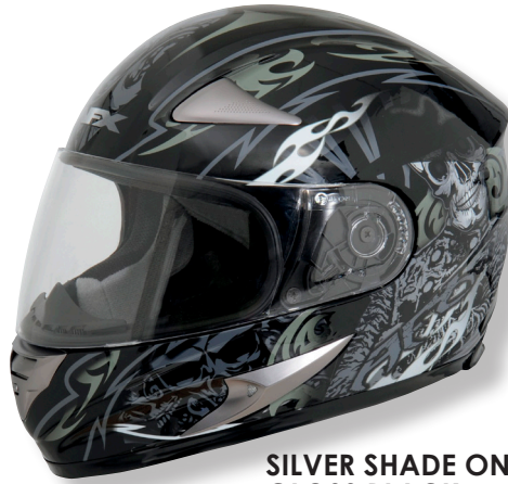
SILVER SHADE ON GLOSS BLACK