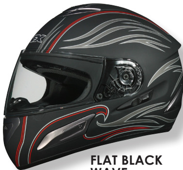
FLAT BLACK WAVE