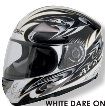
WHITE DARE ON PEARL WHITE