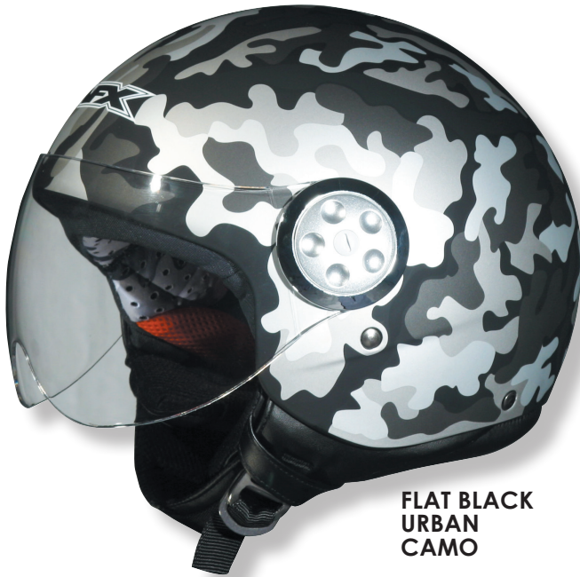
FLAT BLACK URBAN CAMO