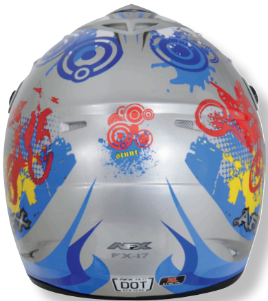
SILVER STUNT P-WHITE