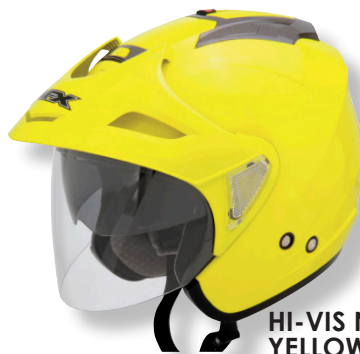
HI-VIS NEON YELLOW