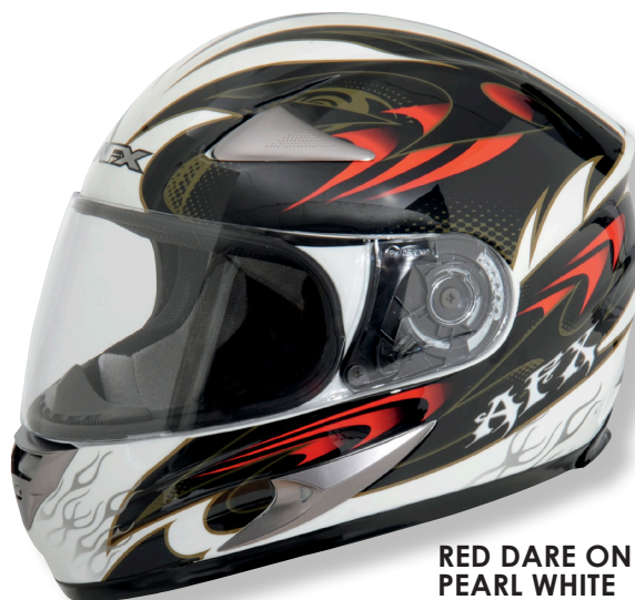
RED DARE ON PEARL WHITE