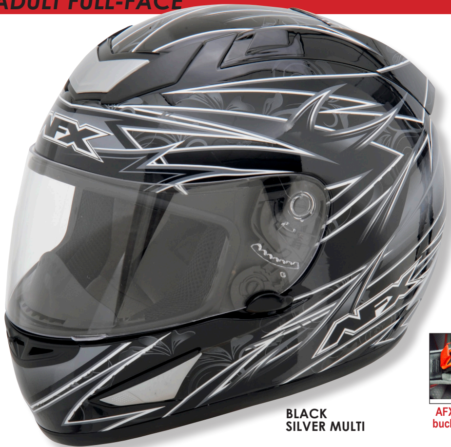
BLACK SILVER MULTI