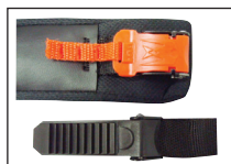
AFX DOT/ECE Cam buckle quick release