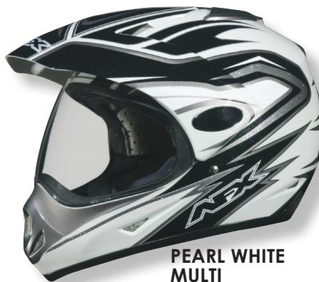
PEARL WHITE MULTI