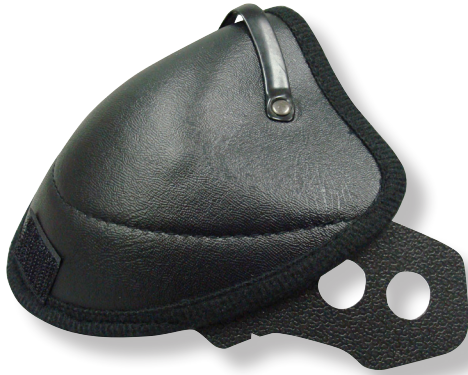
FX-17, 17BH, 17Y SNOW BREATH GUARD PART NUMBER :0134-1214