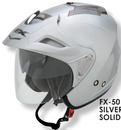
FX-50 SILVER SOLID