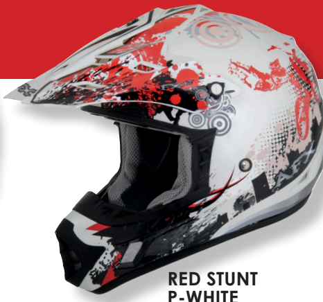
RED STUNT P-WHITE