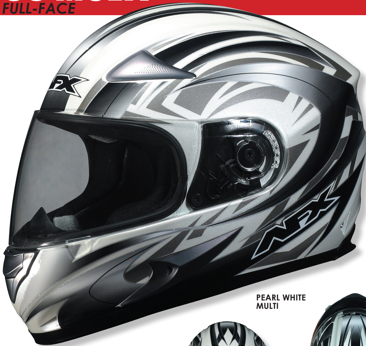
PEARL WHITE MULTI