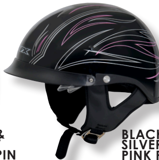
BLACK & SILVER / PINK PIN FLAME