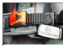
AFX DOT/ECE Cam buckle quick release