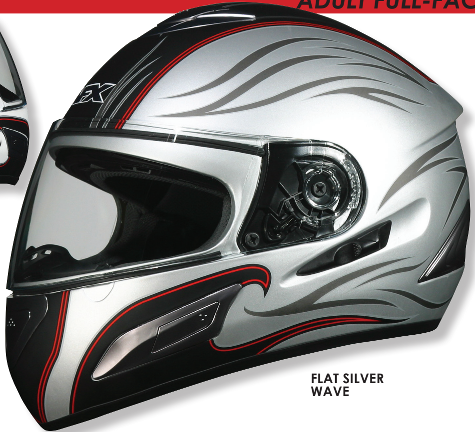
FLAT SILVER WAVE