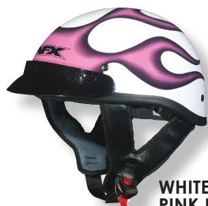
WHITE & PINK FLAME