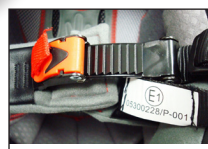
AFX DOT/ECE Cam buckle quick release