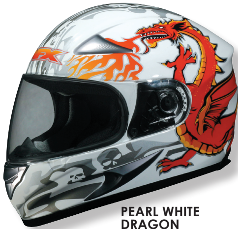
PEARL WHITE DRAGON