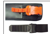
AFX DOT/ECE Cam buckle quick release