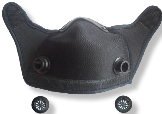
FX-17, 17BH, SNOW BREATH GUARD PART NUMBER :0134-1060