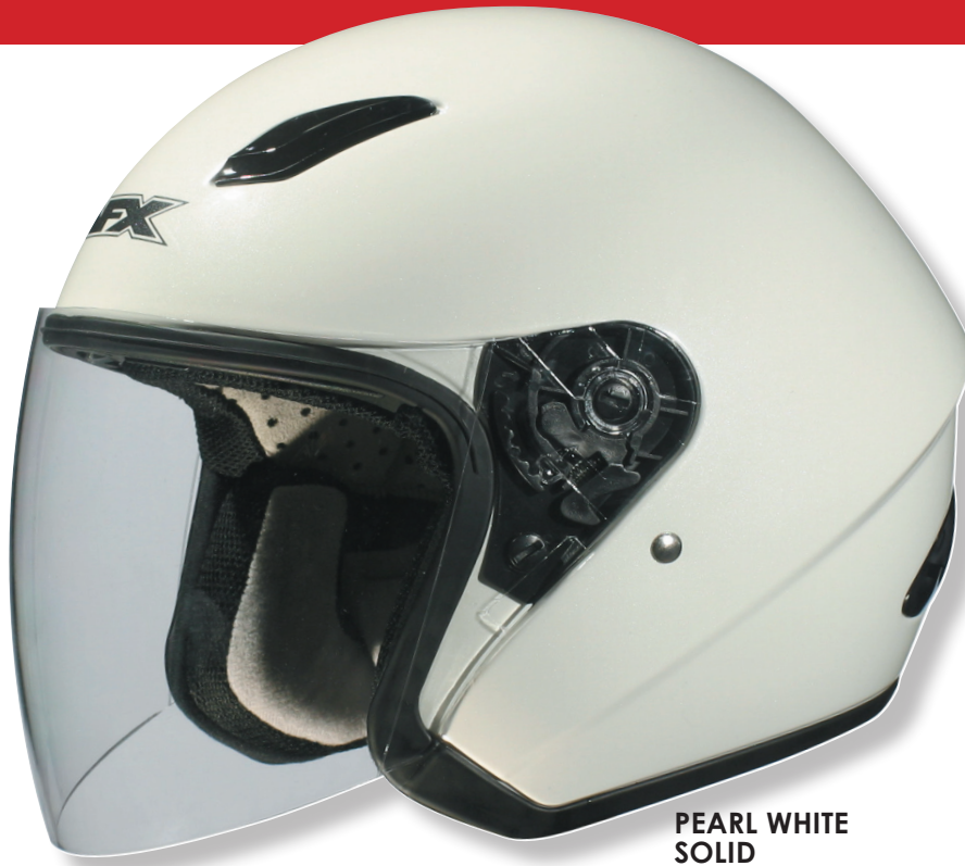
PEARL WHITE SOLID