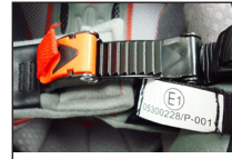
AFX DOT/ECE Cam buckle quick release