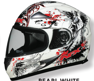
PEARL WHITE DARK ANGEL