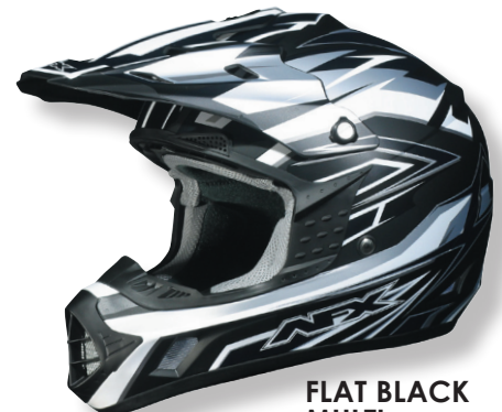
FLAT BLACK MULTI