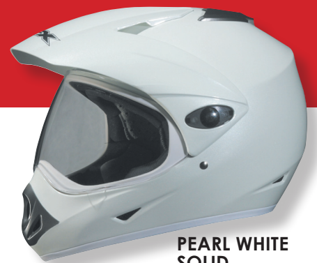
PEARL WHITE SOLID