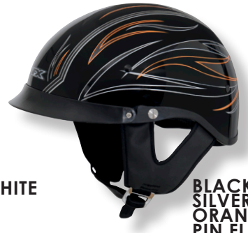
BLACK & SILVER / ORANGE PIN FLAME