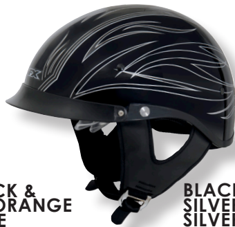
BLACK & SILVER / SILVER PIN FLAME