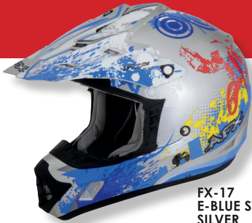
FX-17 E-BLUE STUNT SILVER