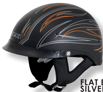
FLAT BLACK & SILVER / ORANGE PIN FLAME