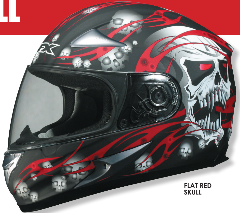
FLAT RED SKULL