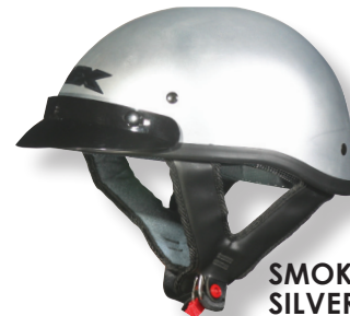
SMOKE SILVER CHROME