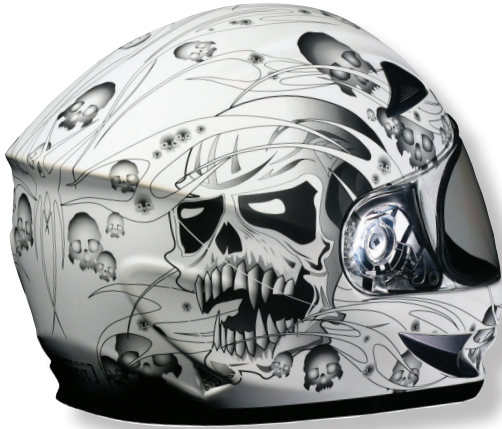
FLAT WHITE SKULL