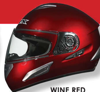
WINE RED SOLID