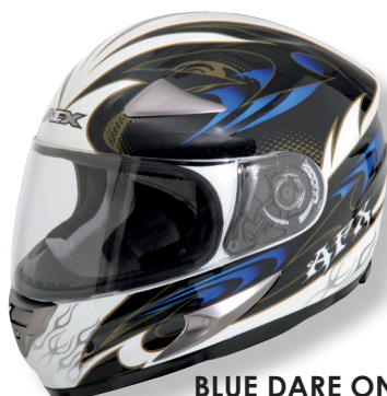
BLUE DARE ON PEARL WHITE