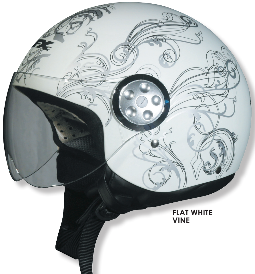
FLAT WHITE VINE