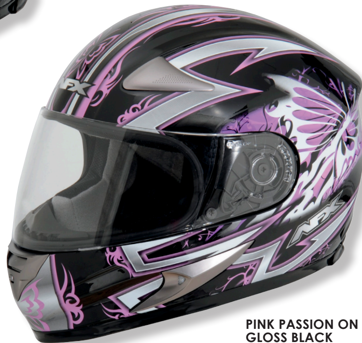
PINK PASSION ON GLOSS BLACK