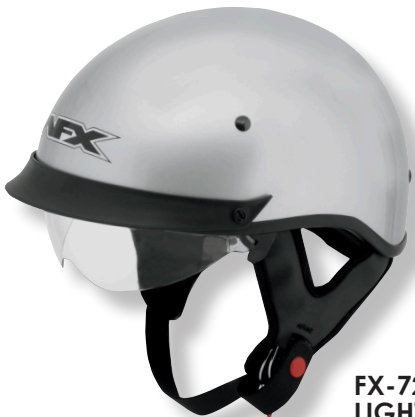
FX-72 LIGHT SILVER SOLID