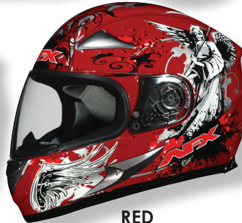
RED DARK ANGEL