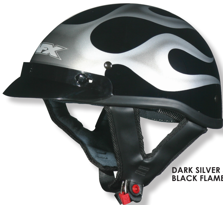
DARK SILVER & BLACK FLAME