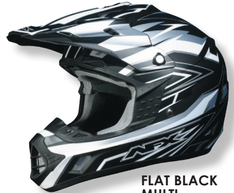
FLAT BLACK MULTI