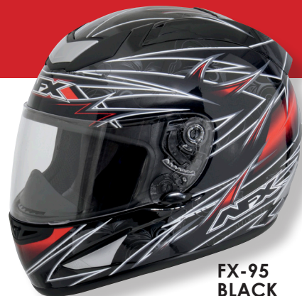
FX-95 BLACK RED MULTI