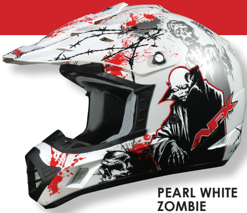
PEARL WHITE ZOMBIE