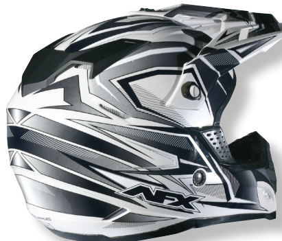
PEARL WHITE MULTI