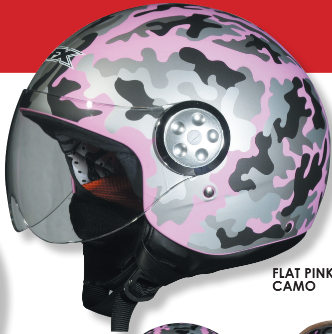
FLAT PINK CAMO