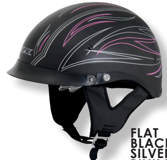
FLAT BLACK & SILVER / PINK PIN FLAME