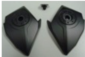
INCLUDES FLAT BLACK SIDE-COVERS AND SCREW PLUG FOR SHIELD USE WITHOUT THE VISOR