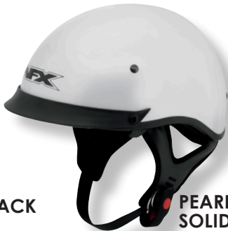
PEARL WHITE SOLID