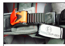
AFX DOT/ECE Cam buckle quick release