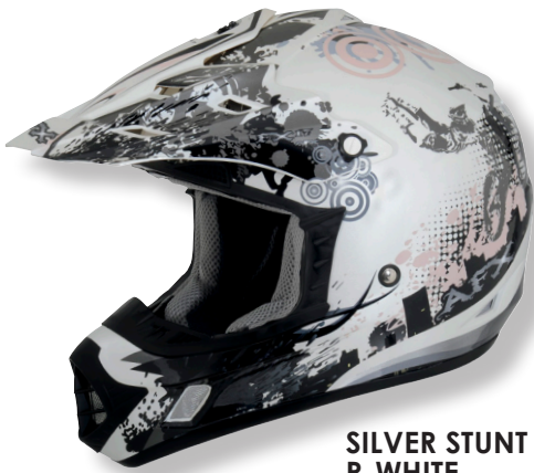
SILVER STUNT P-WHITE