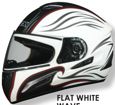
FLAT WHITE WAVE