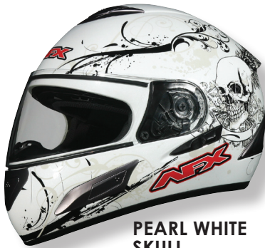
PEARL WHITE SKULL