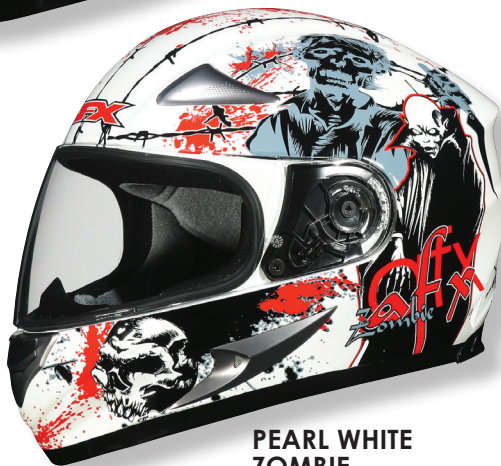
PEARL WHITE ZOMBIE