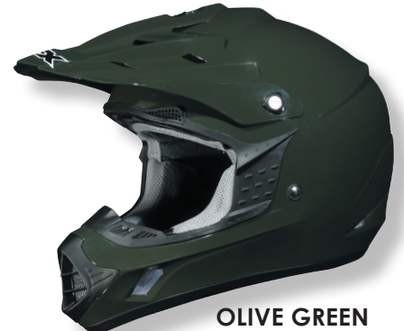
OLIVE GREEN SOLID