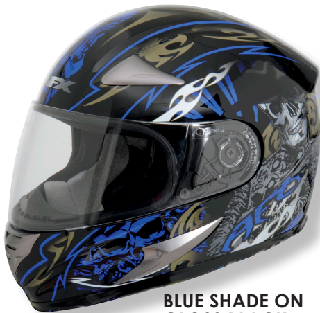
BLUE SHADE ON GLOSS BLACK