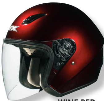
WINE RED SOLID