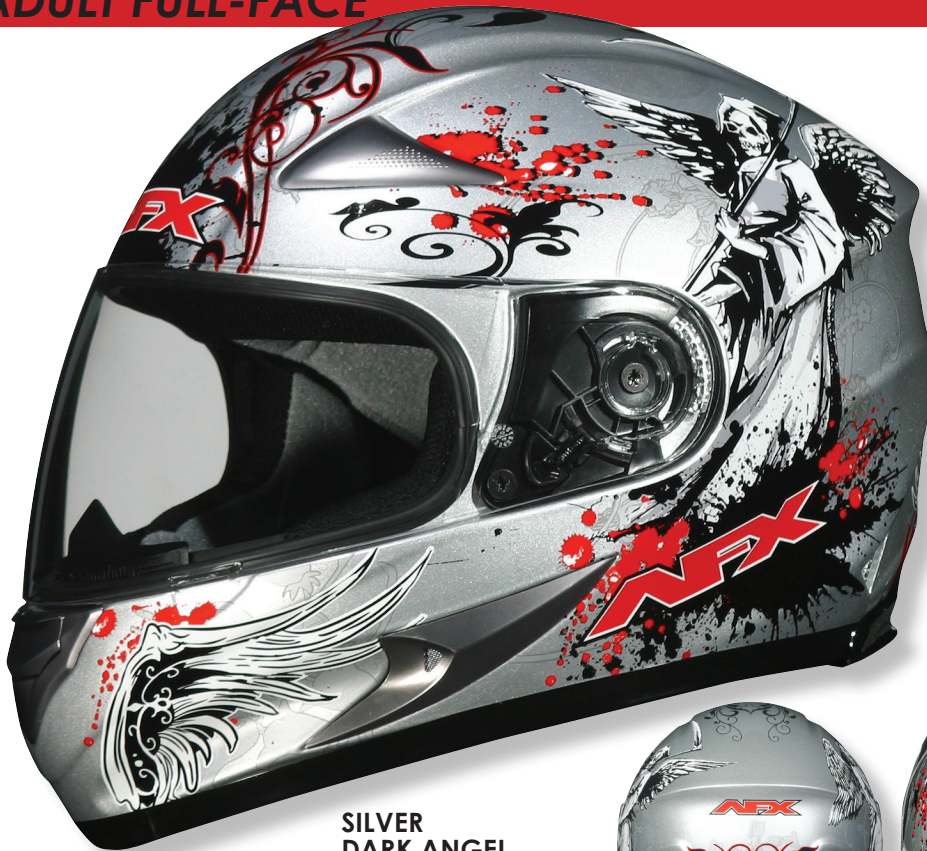
SILVER DARK ANGEL