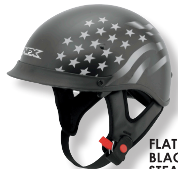
FLAT BLACK STEALTH