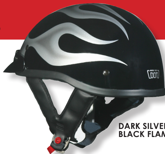
DARK SILVER & BLACK FLAME