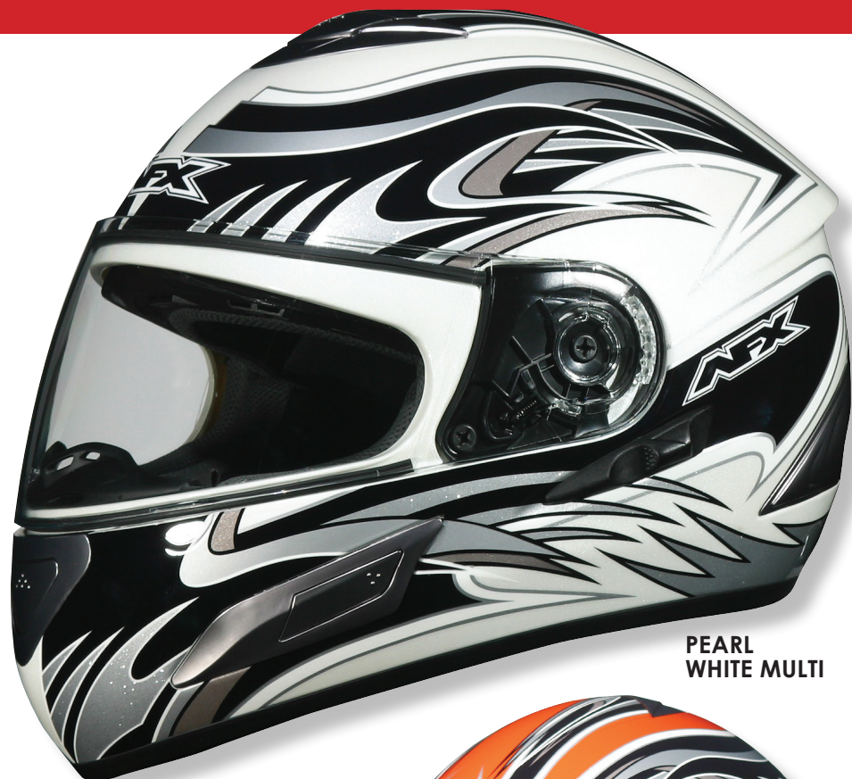
PEARL WHITE MULTI