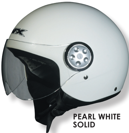
PEARL WHITE SOLID