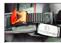
AFX DOT/ECE Cam buckle quick release