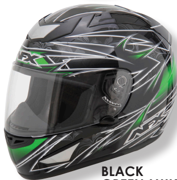
BLACK GREEN MULTI