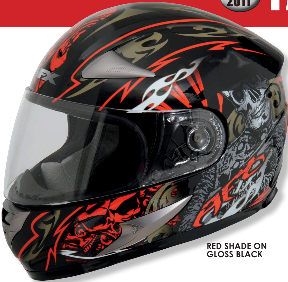
RED SHADE ON GLOSS BLACK