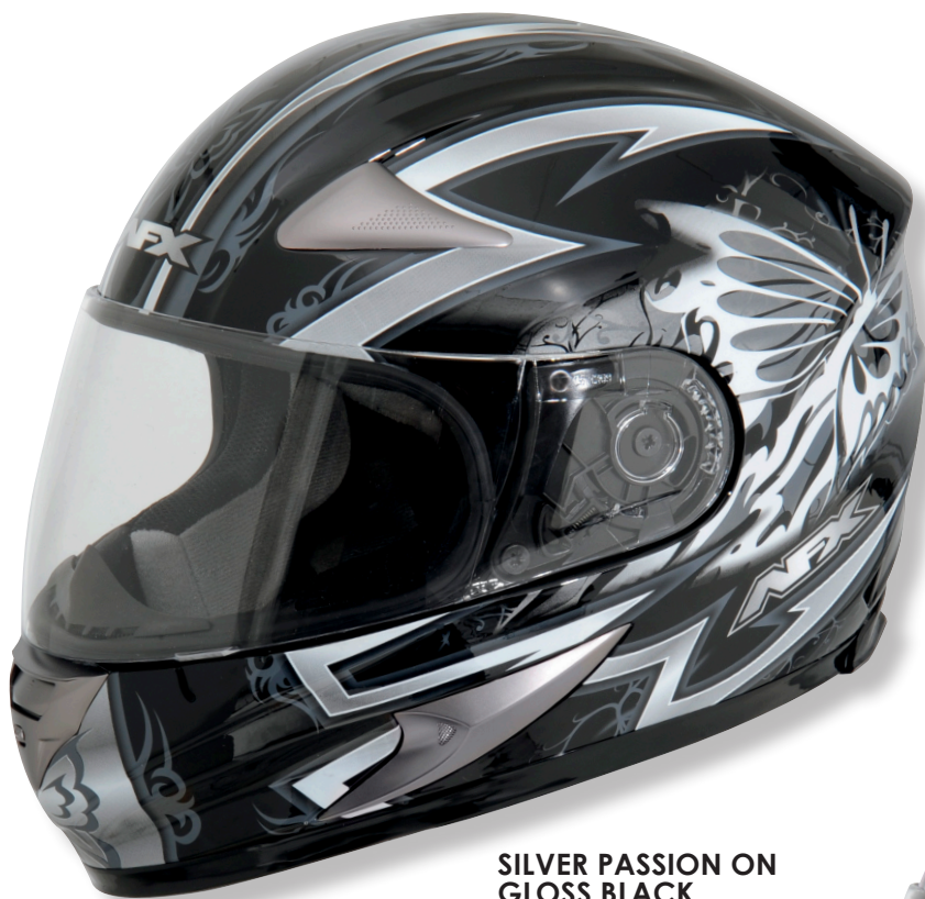
SILVER PASSION ON GLOSS BLACK