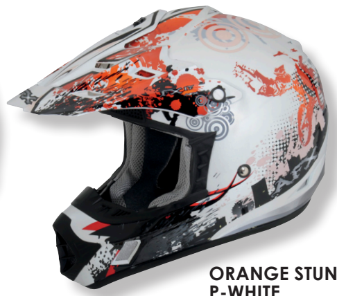
ORANGE STUNT P-WHITE