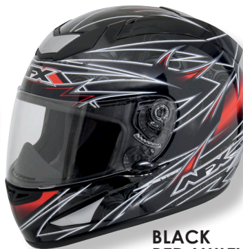
BLACK RED MULTI