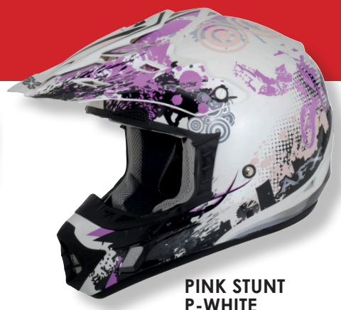
PINK STUNT P-WHITE