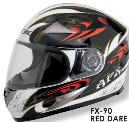
FX-90 RED DARE ON PEARL WHITE