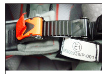
AFX DOT/ECE Cam buckle quick release