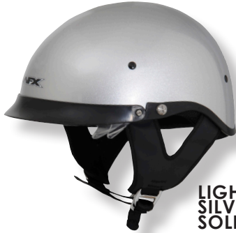
LIGHT SILVER SOLID