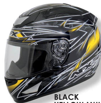
BLACK YELLOW MULTI