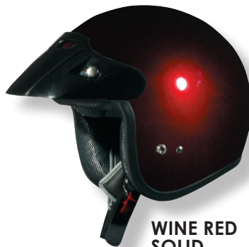
WINE RED SOLID