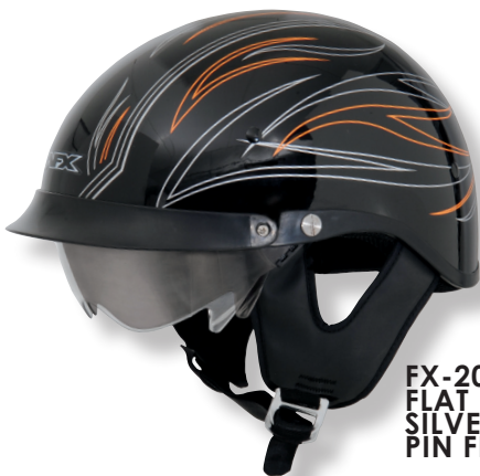
FX-200 FLAT BLACK & SILVER / ORANGE PIN FLAME