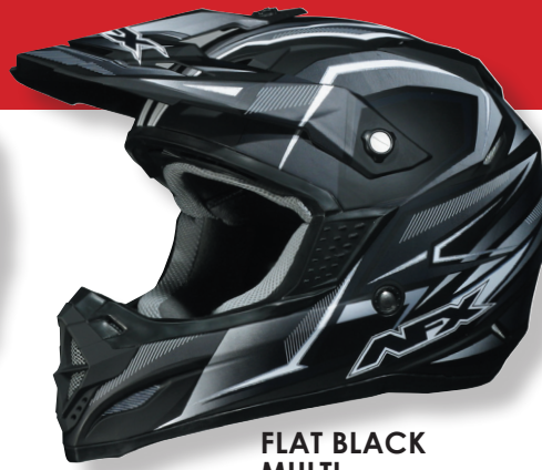
FLAT BLACK MULTI