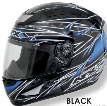
BLACK BLUE MULTI