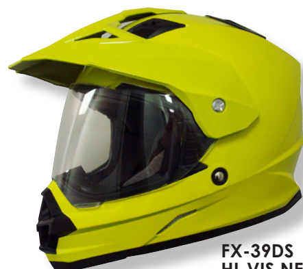
FX-39DS HI-VIS NEON YELLOW