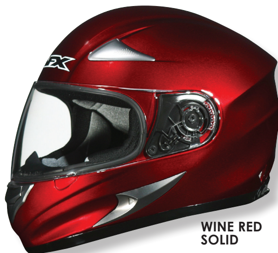
WINE RED SOLID