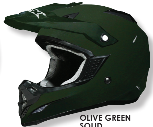
OLIVE GREEN SOLID