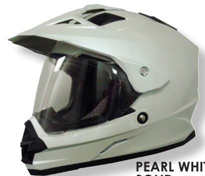
PEARL WHITE SOLID