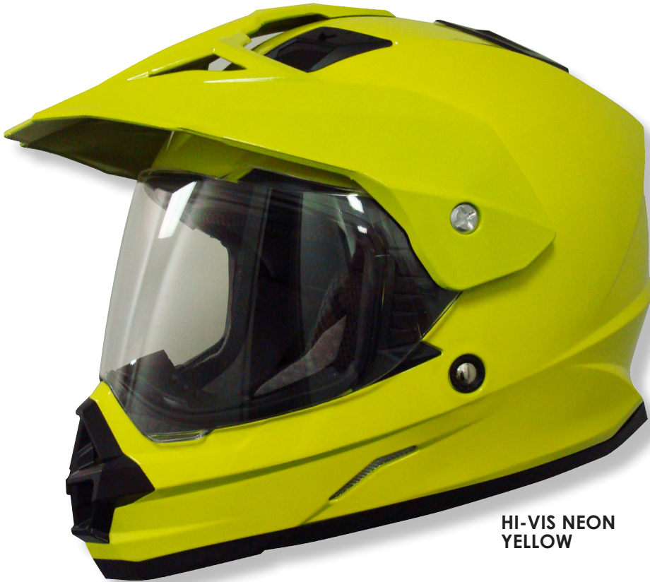
HI-VIS NEON YELLOW

INCLUDES FLAT BLACK SIDE-COVERS AND SCREW PLUG FOR SHIELD USE WITHOUT THE VISOR