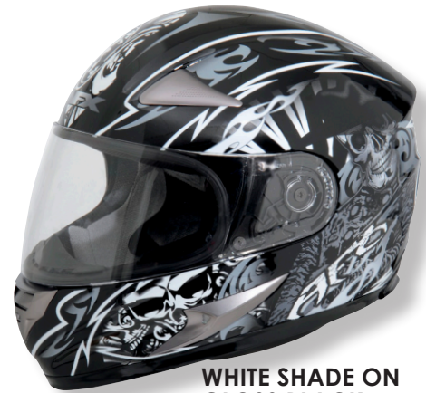
WHITE SHADE ON GLOSS BLACK