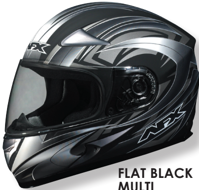
FLAT BLACK MULTI