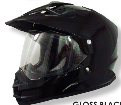
GLOSS BLACK SOLID