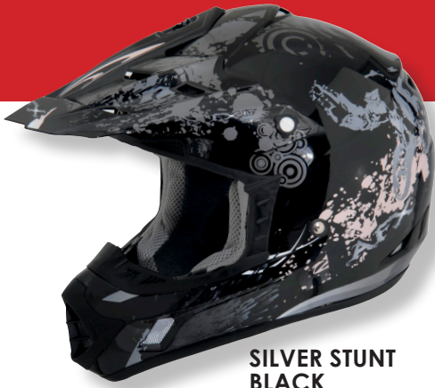
SILVER STUNT BLACK