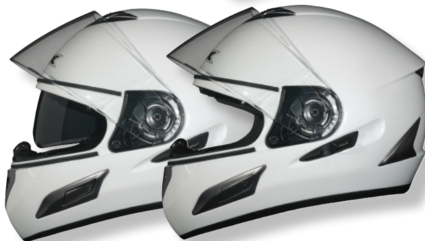
FX-100 Dark smoke tinted one touch inner flip down sun shield system