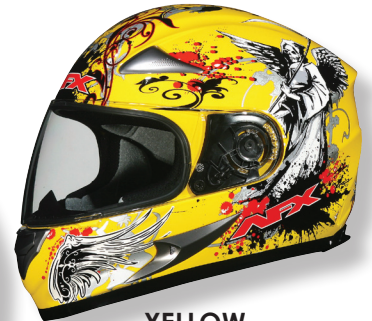
YELLOW DARK ANGEL