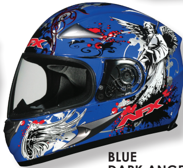
BLUE DARK ANGEL