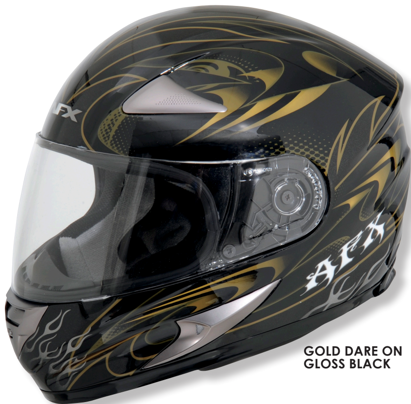
GOLD DARE ON GLOSS BLACK