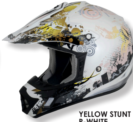
YELLOW STUNT P-WHITE