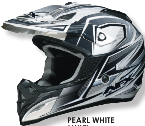
PEARL WHITE MULTI