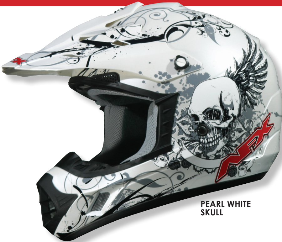
PEARL WHITE SKULL