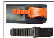
AFX DOT/ECE Cam buckle quick release