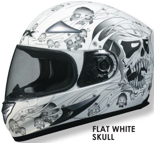
FLAT WHITE SKULL