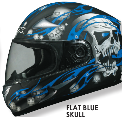
FLAT BLUE SKULL