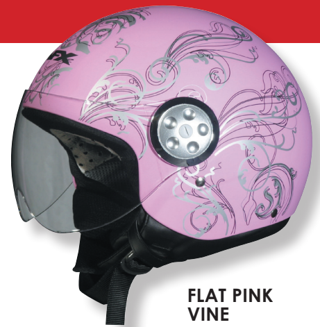
FLAT PINK VINE