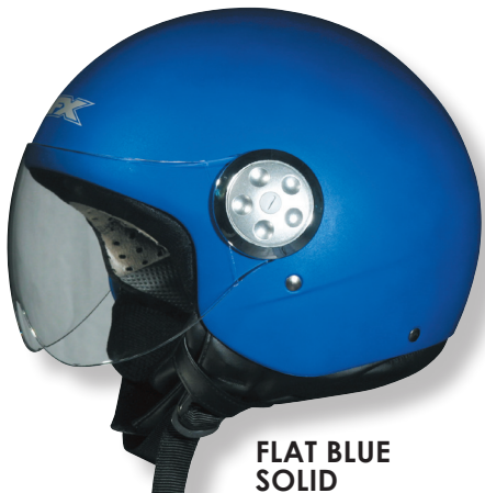
FLAT BLUE SOLID