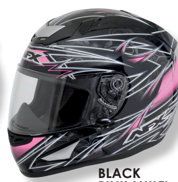
BLACK PINK MULTI