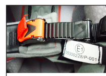
AFX DOT/ECE Cam buckle quick release