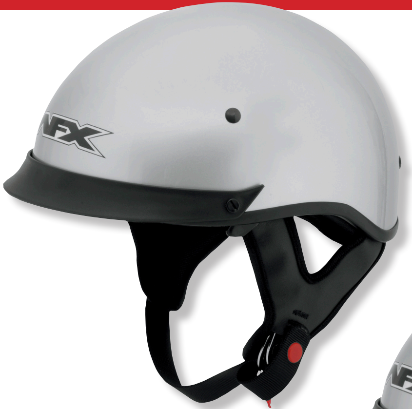
LIGHT SILVER SOLID