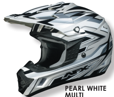
PEARL WHITE MULTI