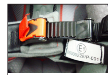
AFX DOT/ECE Cam buckle quick release