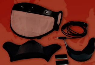
OPTIONAL DUAL-LENS ELECTRIC SHIELD