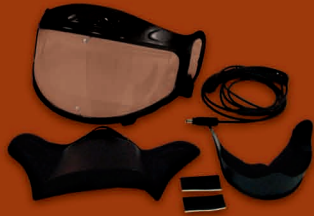
OPTIONAL DUAL-LENS ELECTRIC SHIELD