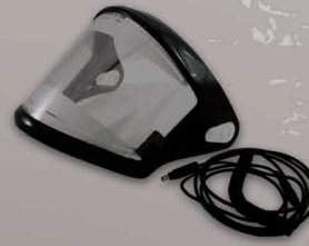
OPTIONAL DUAL-LENS ELECTRIC SHIELD