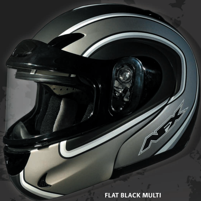
FLAT BLACK MULTI