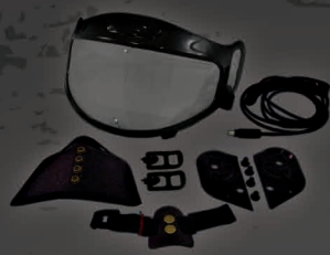
OPTIONAL DUAL-LENS ELECTRIC SHIELD