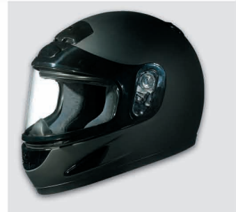
FLAT BLACK SOLID