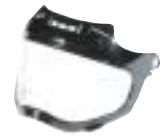
FX-87X, FX-87XY J