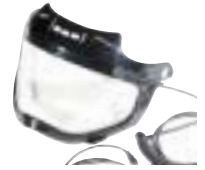
FX-87X, FX-87XY E