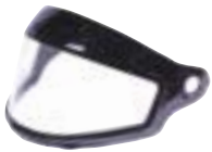
FX-10, FX-15 F