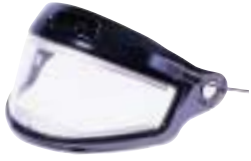
FX-10, FX-15 A