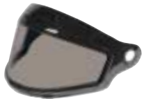
FX-10, FX-15 K