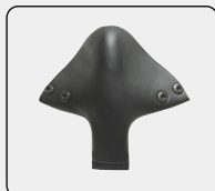
OPTIONAL SNOW BREATH GUARD