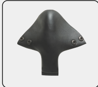
OPTIONAL SNOW BREATH GUARD FX-TBA